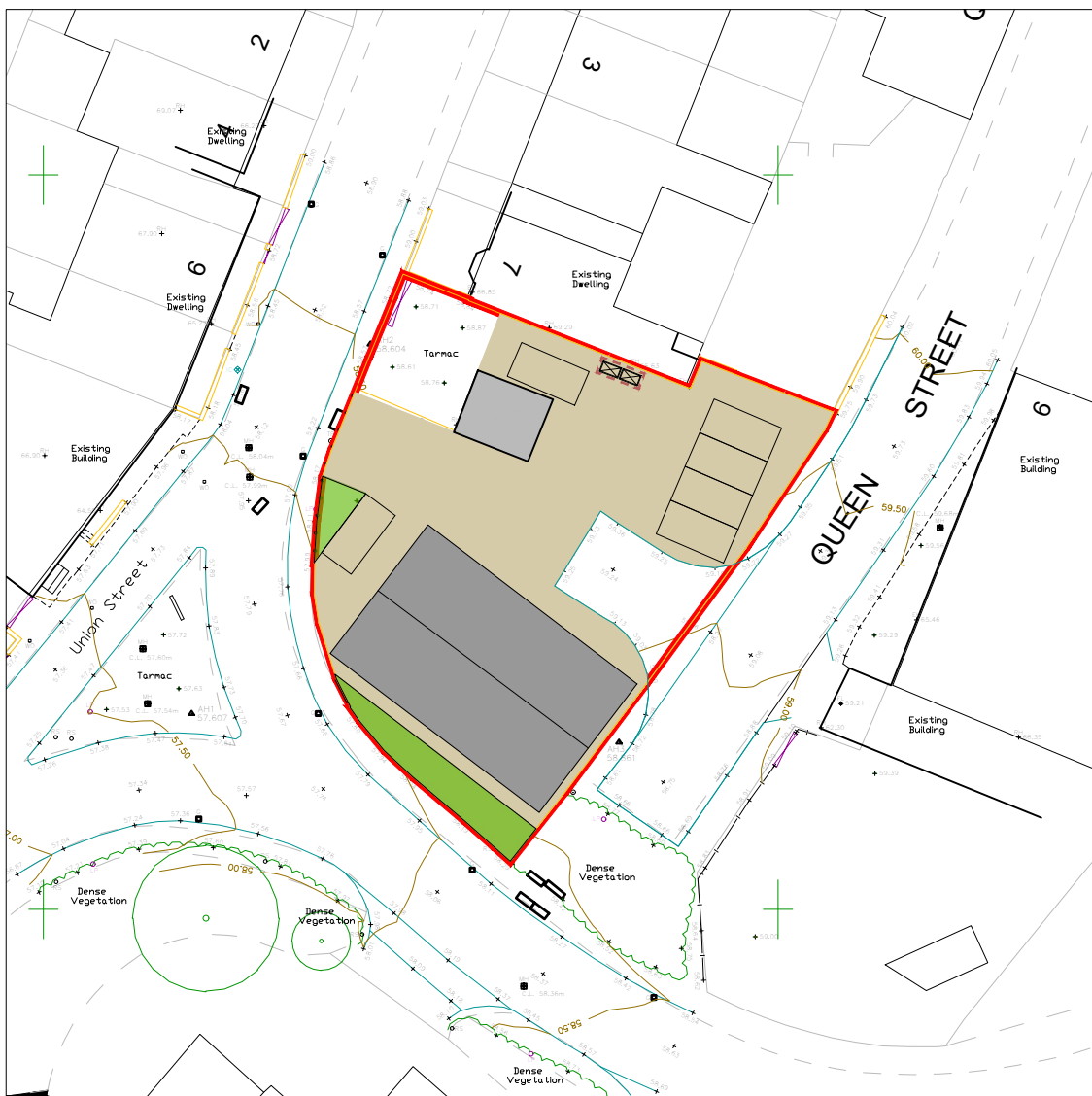
PROPOSED SITE PLAN 1:500@A3