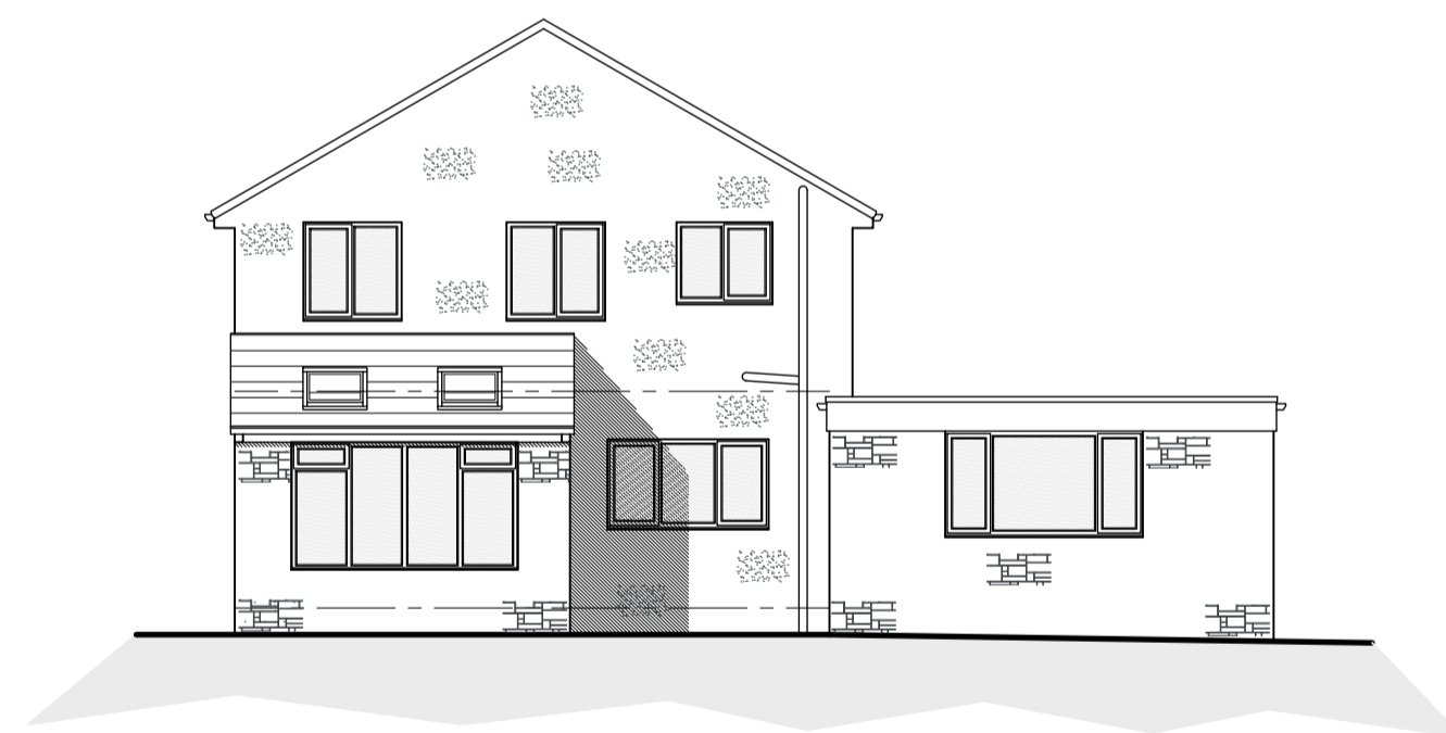
Existing South West Facing Rear Elevation Scale 1:100