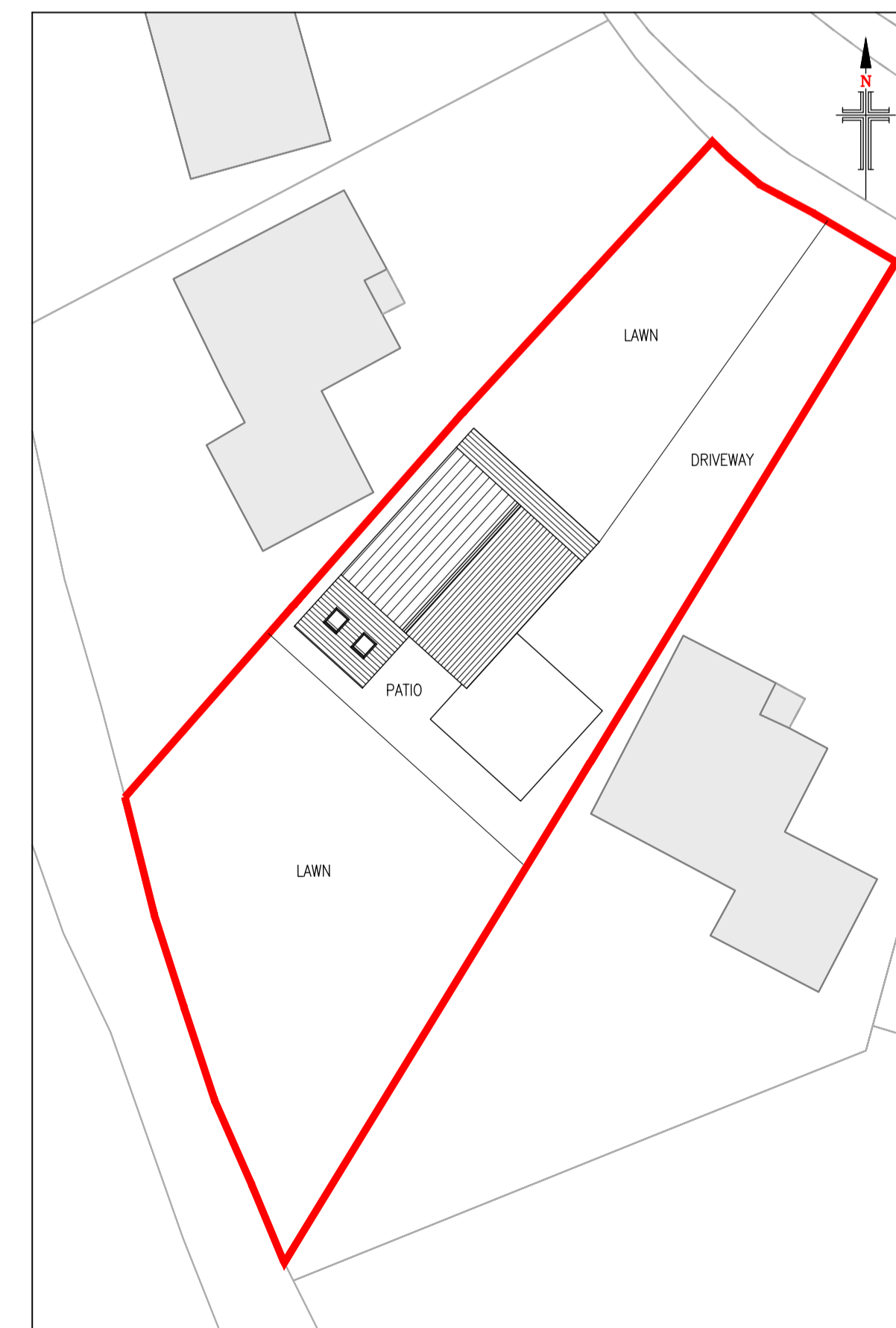
Existing Site Layout Scale 1:250