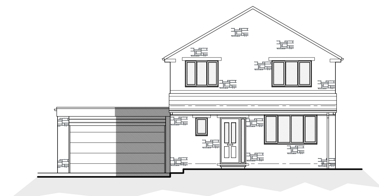
Existing North East Facing Front Elevation Scale 1:100