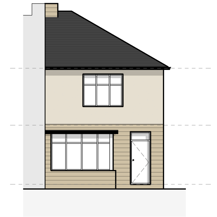
03 - PROPOSED FRONT ELEVATION 1 : 100