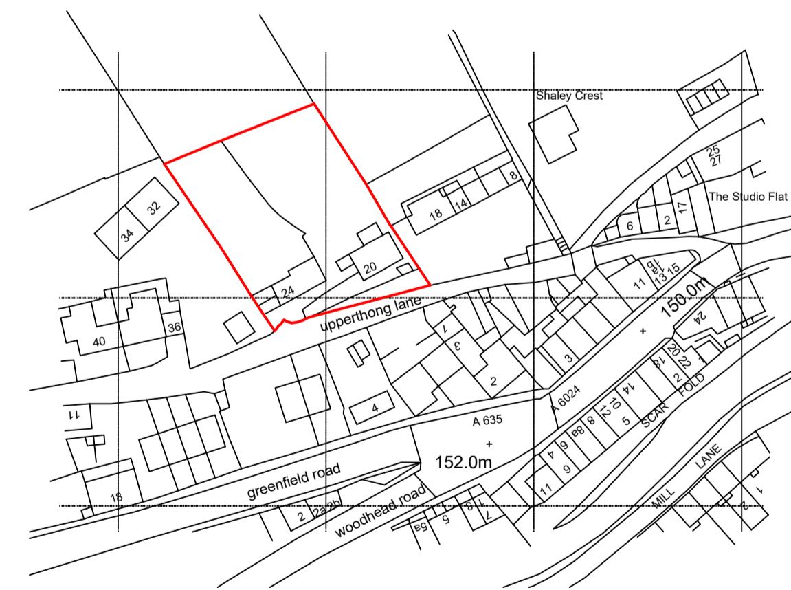
location plan (1:1250)

This drawing has been prepared specifically for the purpose of obtaining Planning Permission and/or Building Regulation Approval. Its suitability for other purposes, without supplementary details and specifications cannot be guaranteed. The Permissions and/or Approvals are beyond the Architects control, and no guarantee that such will be granted is given or to be inferred by reason of the preparation of this drawing.