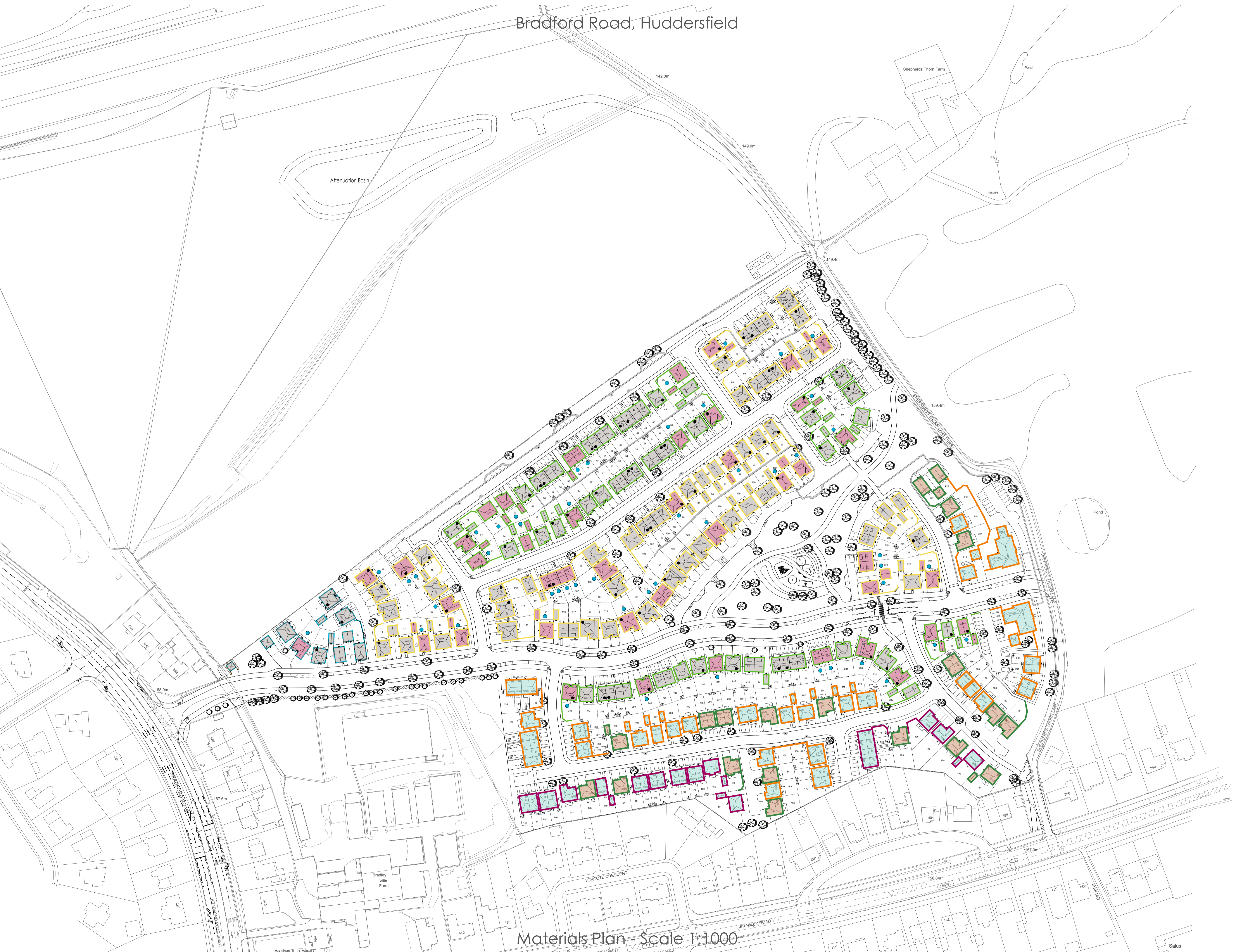
Materials Plan - Scale 1:1000