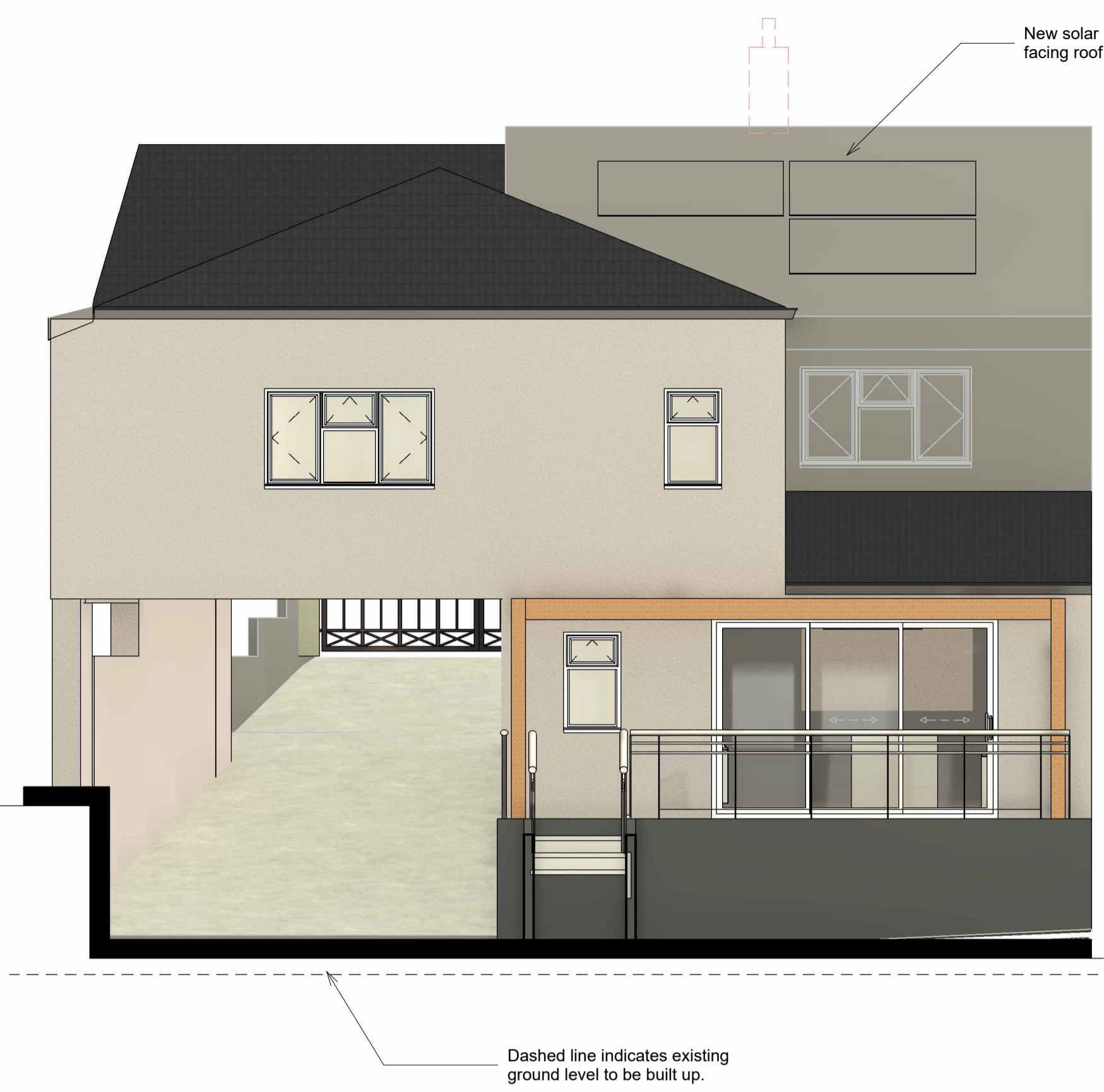
1 Proposed South Elevation 1 : 50