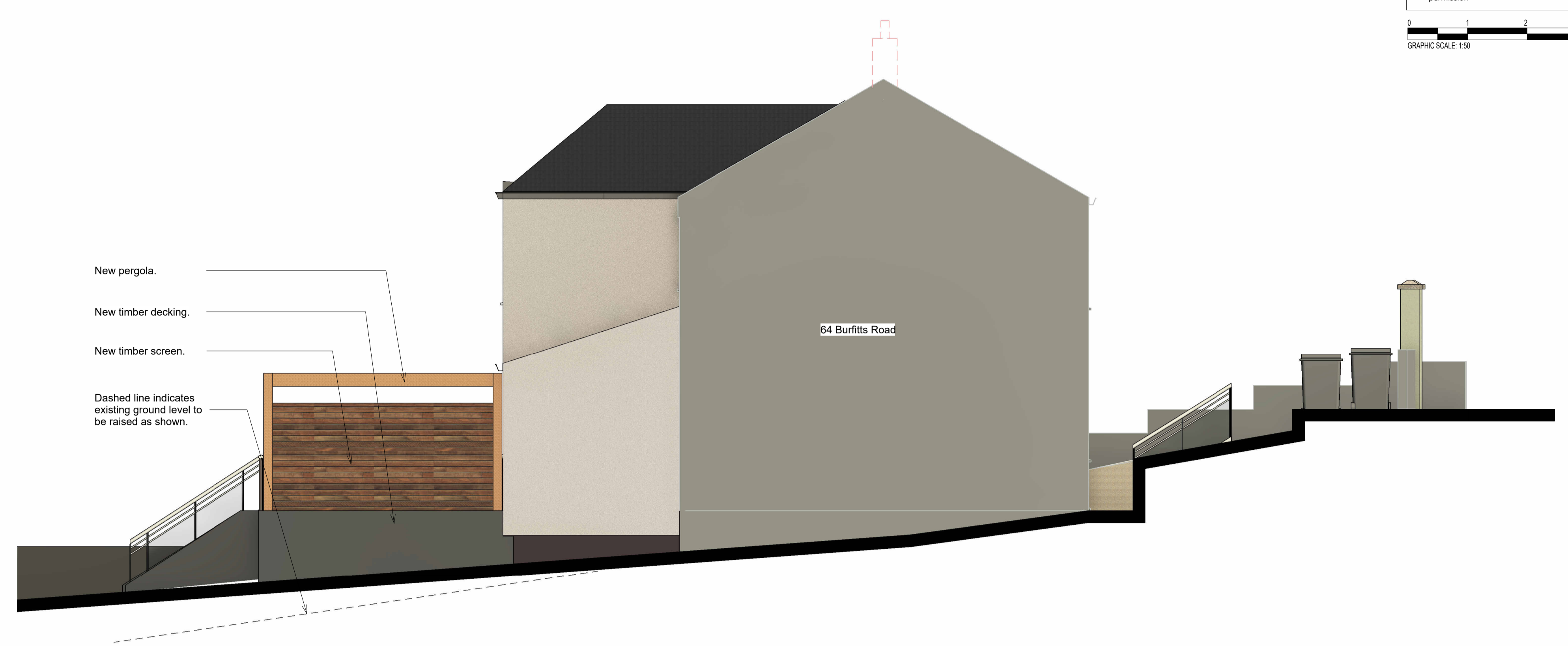
2 Proposed East Elevation 1 : 50