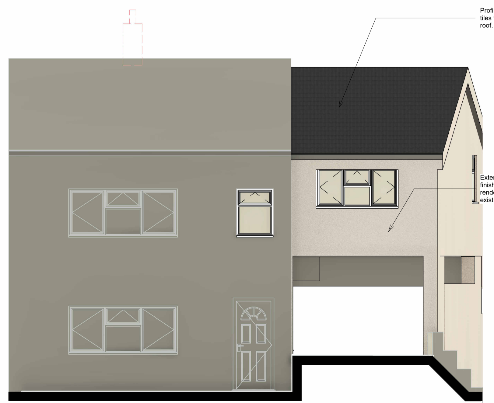
3 Proposed North Elevation 1 : 50