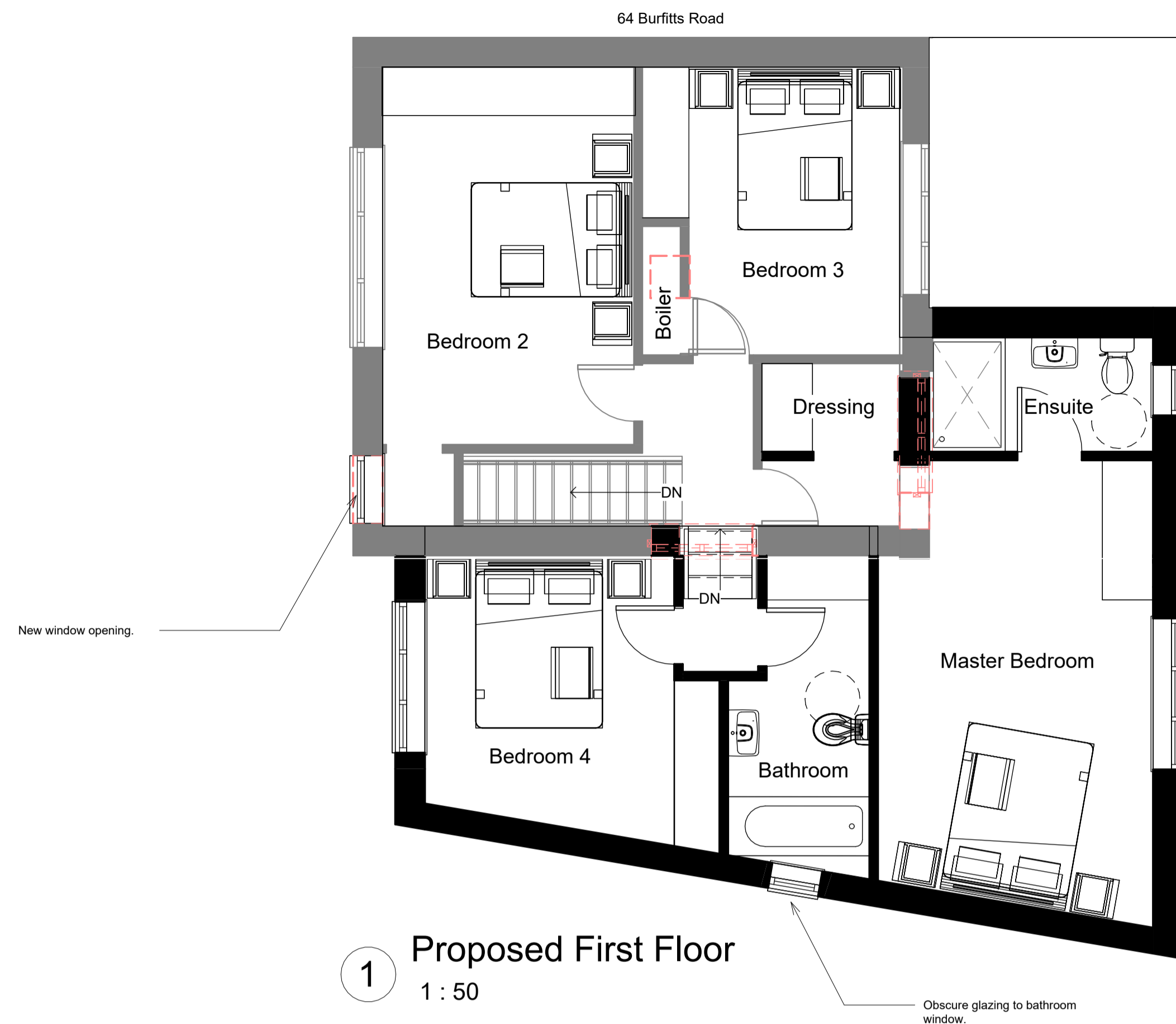
1 Proposed First Floor 1 : 50