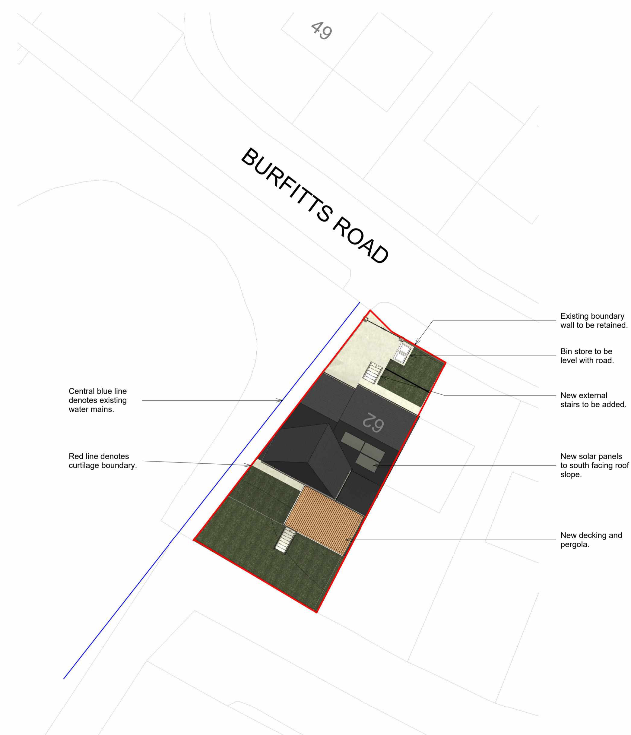
1 Proposed Site Plan 1 : 200