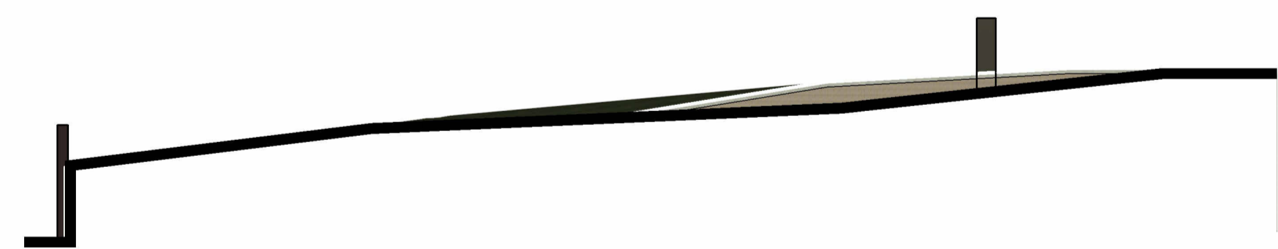
6 East Driveway Elevation 1 : 100