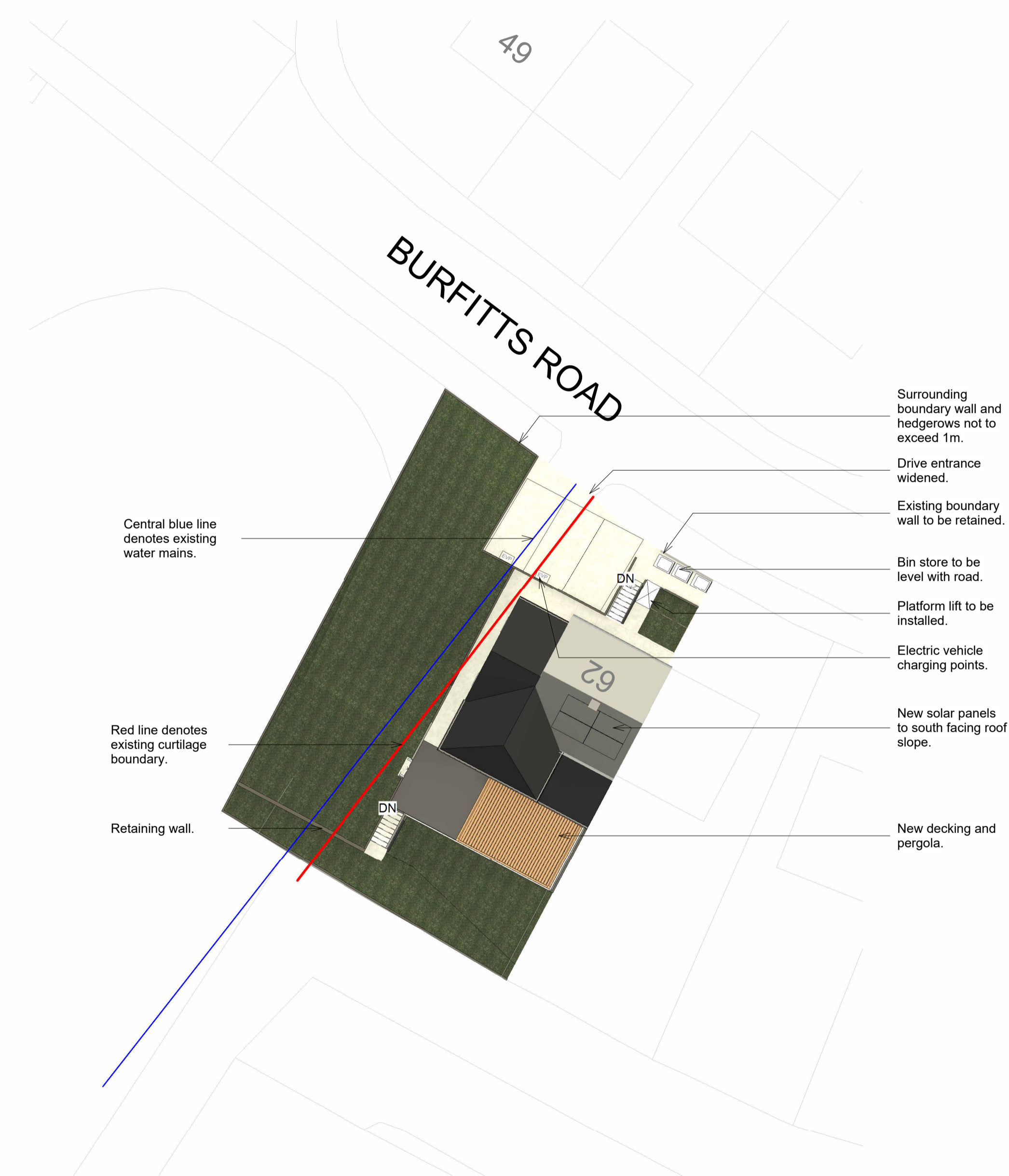
7 Proposed Site Plan With Extended Land 1 : 200