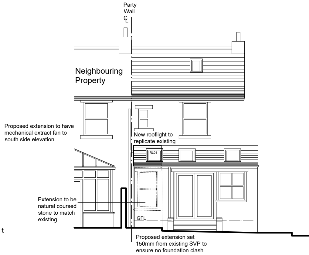
East Elevation (front)

scale date sheet size dwg. no. 1:100 11/2024 A3 24/972/07a