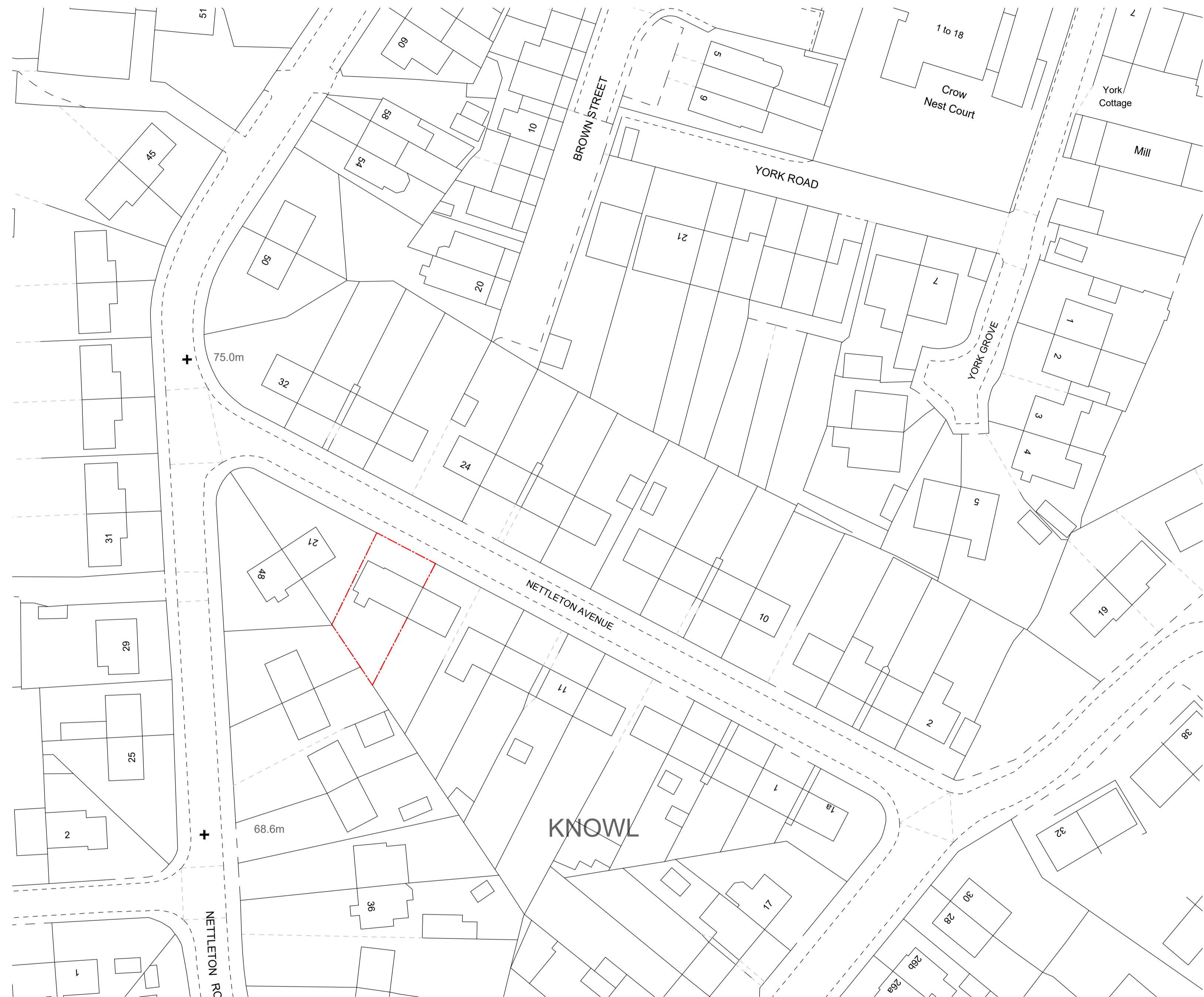
Proposed Site Plan Scale 1:500