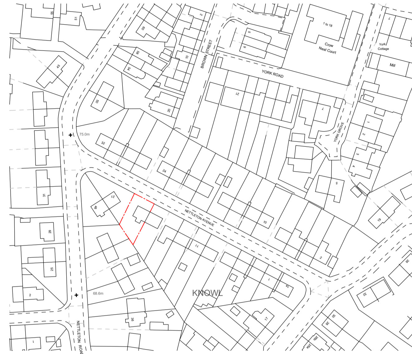
Existing Location Plan Scale 1:1250