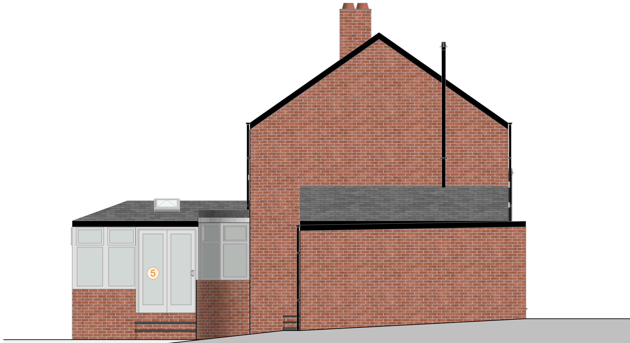
PROPOSED SIDE 2 ELEVATION 1:50@A3

⑤ WHITE UPVC SLIDING DOORS TO MATCH EXISTING