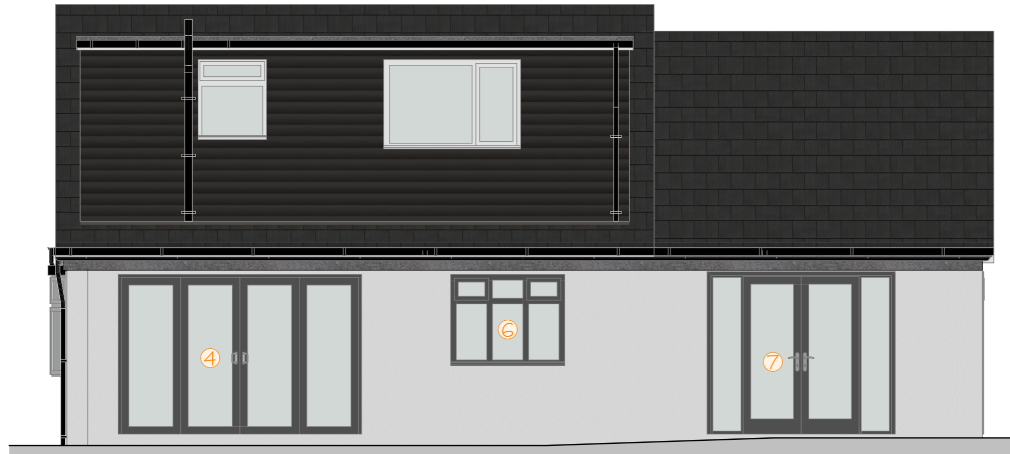
PROPOSED REAR ELEVATION ④ GREY BI-FOLD DOORS ⑥ GREY UPVC WINDOWS ⑦ GREY UPVC DOUBLE DOORS WITH SIDELIGHTS 1:50@A3