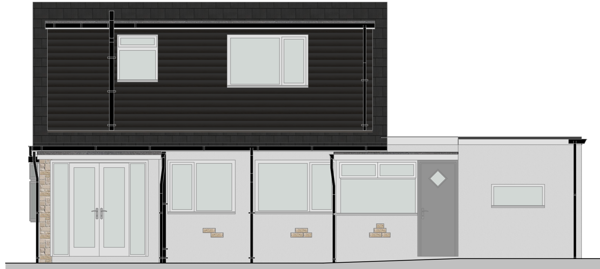
EXISTING REAR ELEVATION 1:50@A3