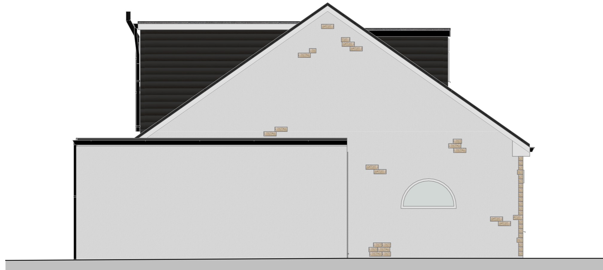
EXISTING SIDE 2 ELEVATION 1:50@A3

This drawing is the property of Concept - Architecture & Structural Design Ltd. This drawing should not be reproduced without receiving their written permission.