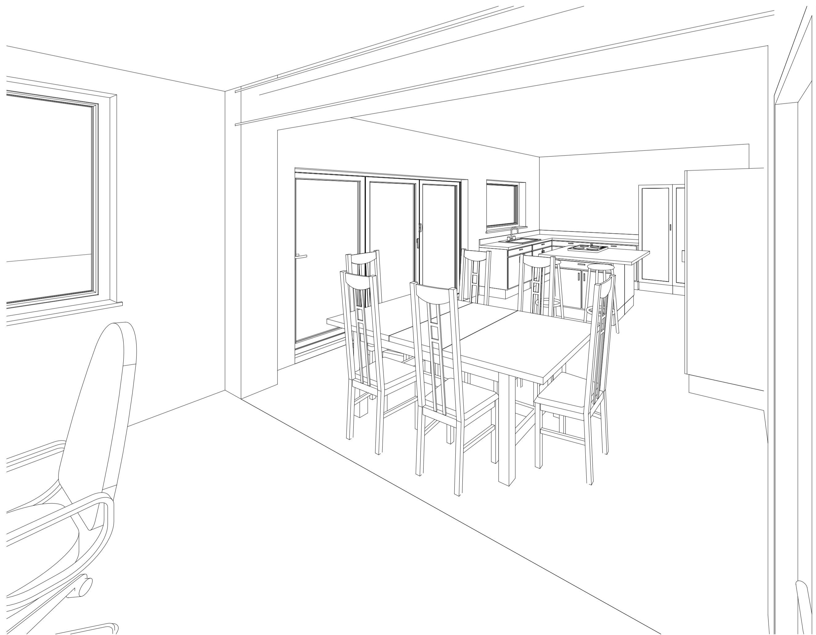
Kitchen 3D View