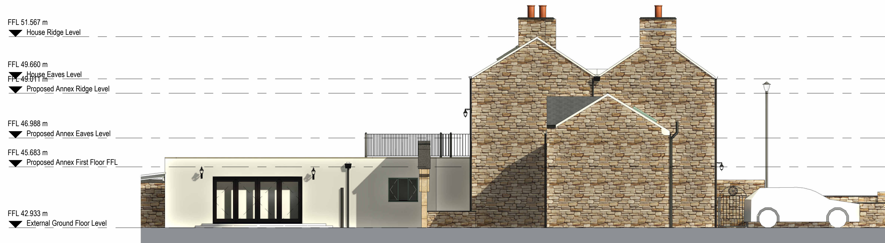
Proposed East Elevation 1 : 100

RWP Denotes Rainwater Pipe SVP Denotes Soil and Vent Pipe