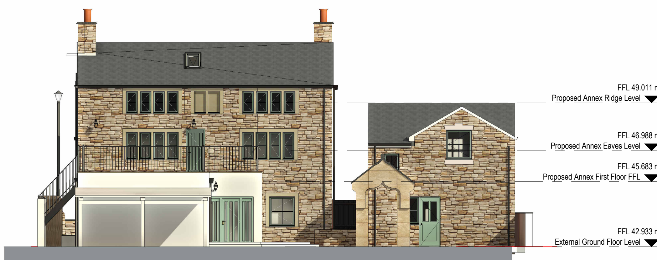
Proposed South Elevation 1 : 100