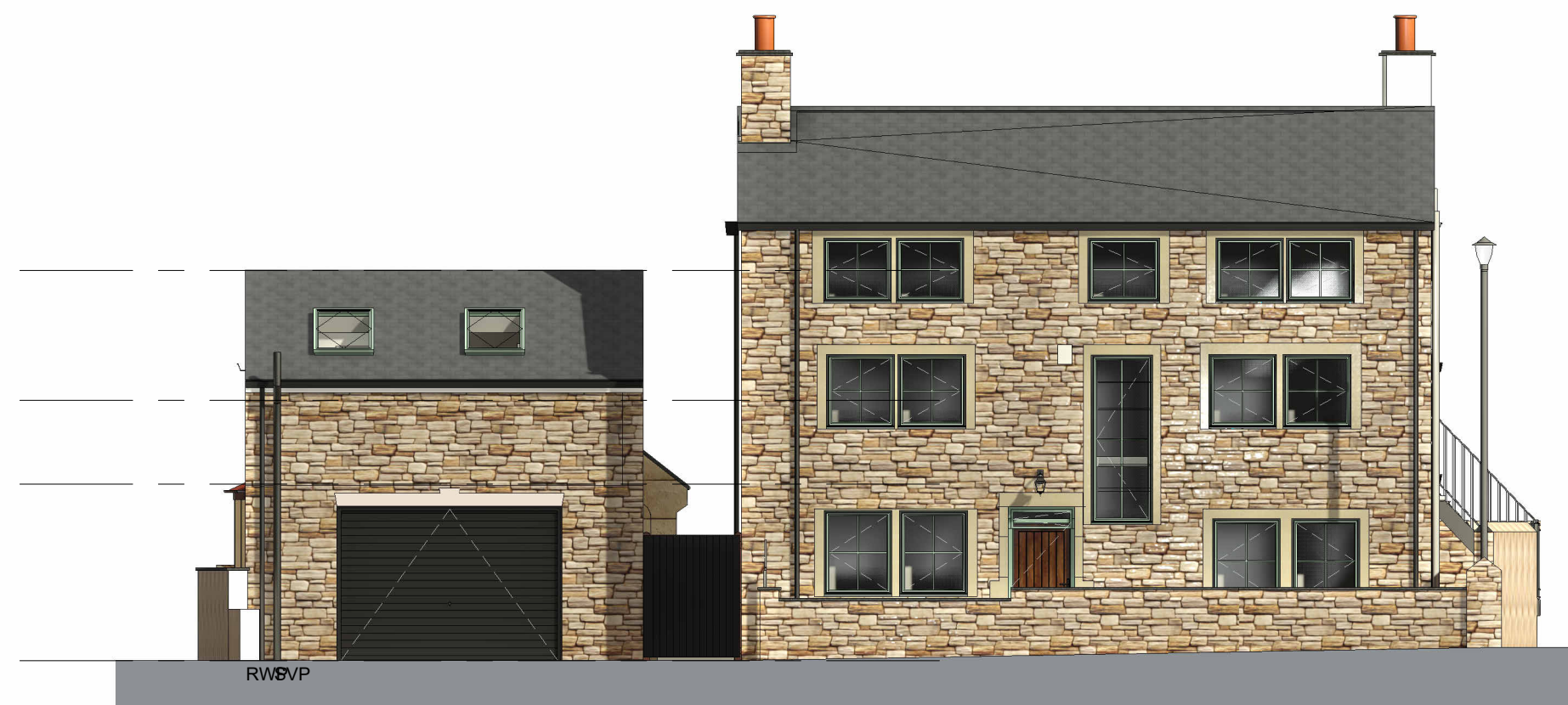
Proposed North Elevation 1 : 100