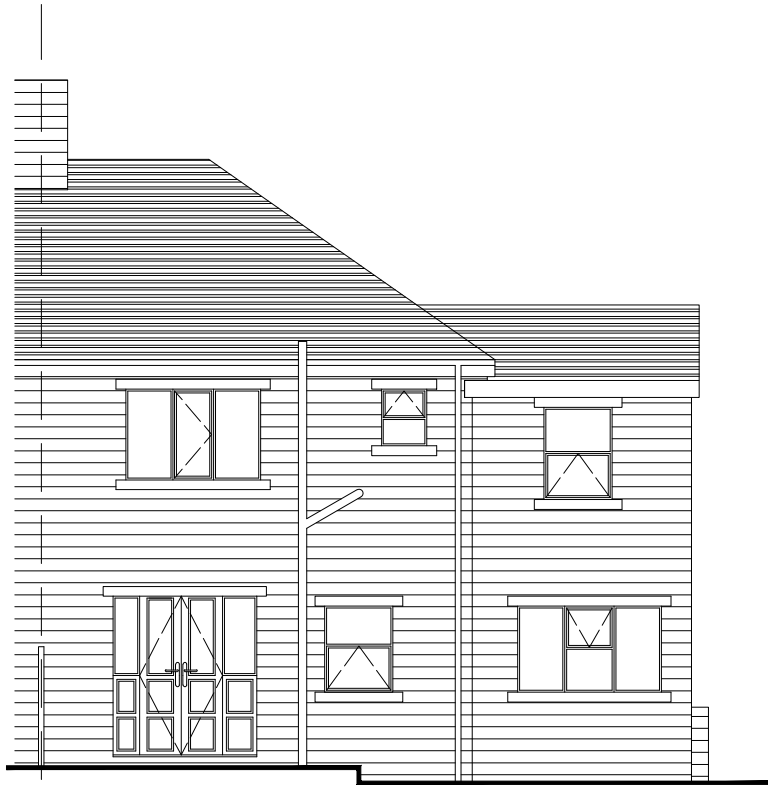
EAST ELEVATION - EXISTING