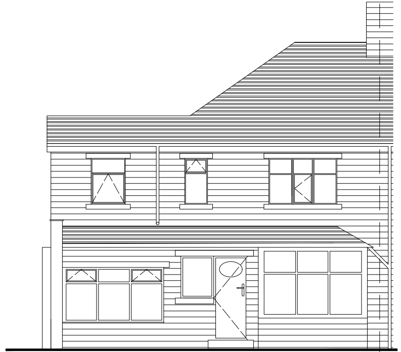
WEST ELEVATION - EXISTING