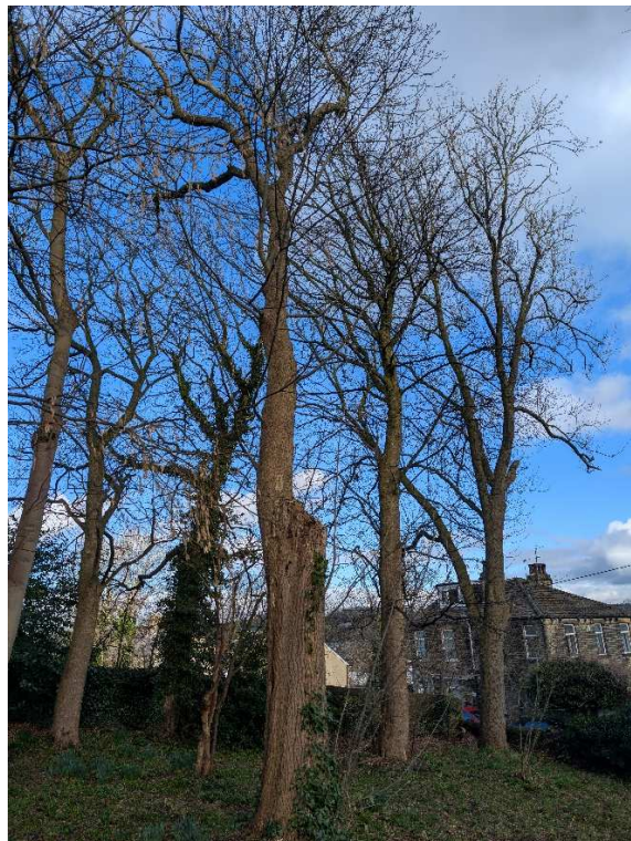
T5: Recommended for removal.