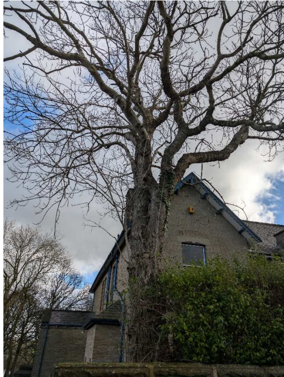
T3: Recommended for removal.