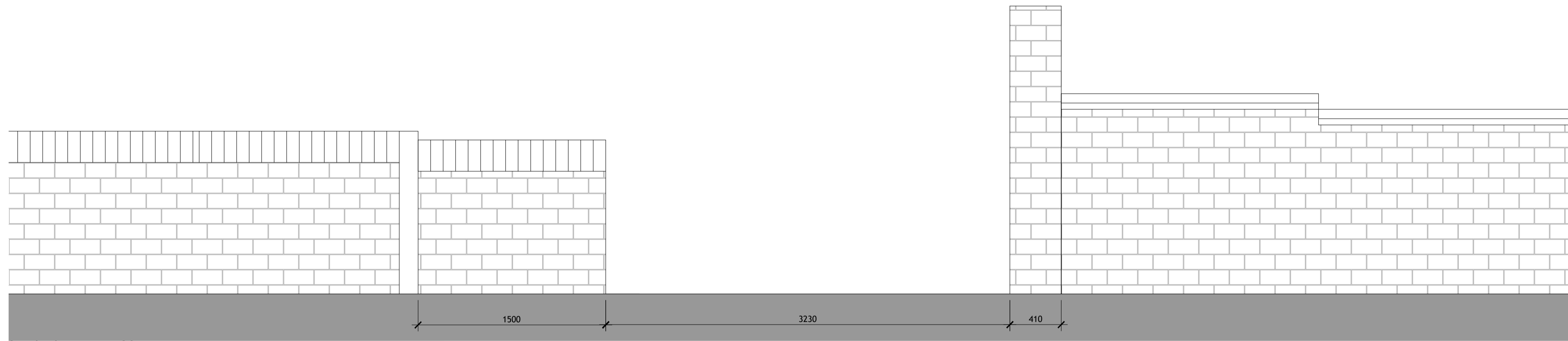
South Elevation 1.20