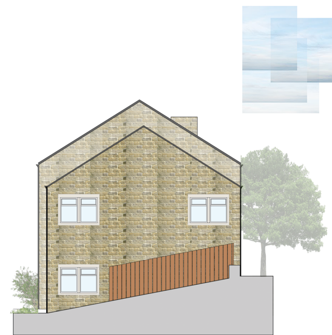
SIDE (NORTH) ELEVATION_ AS EXISTING Scale 1:100