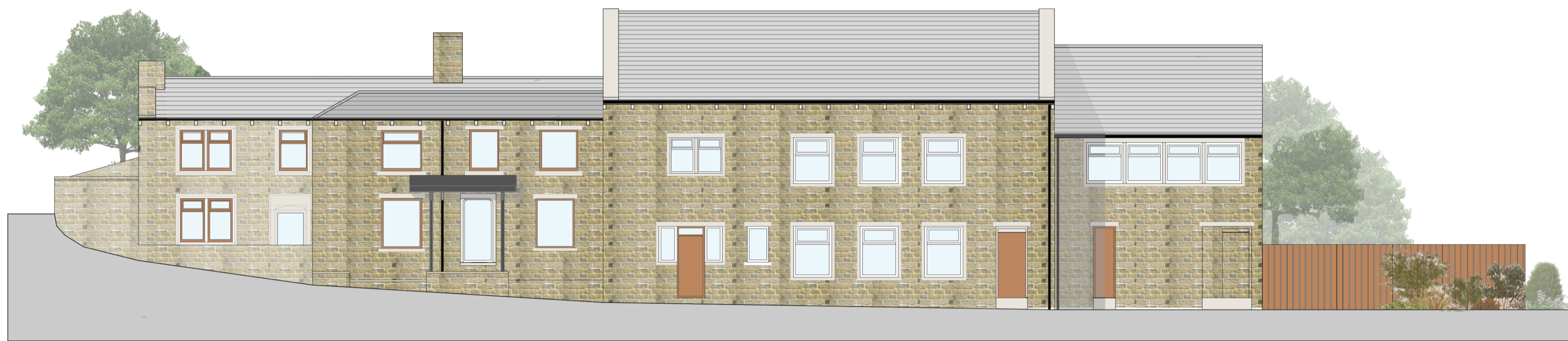
FRONT (EAST) ELEVATION_ AS EXISTING Scale 1:100