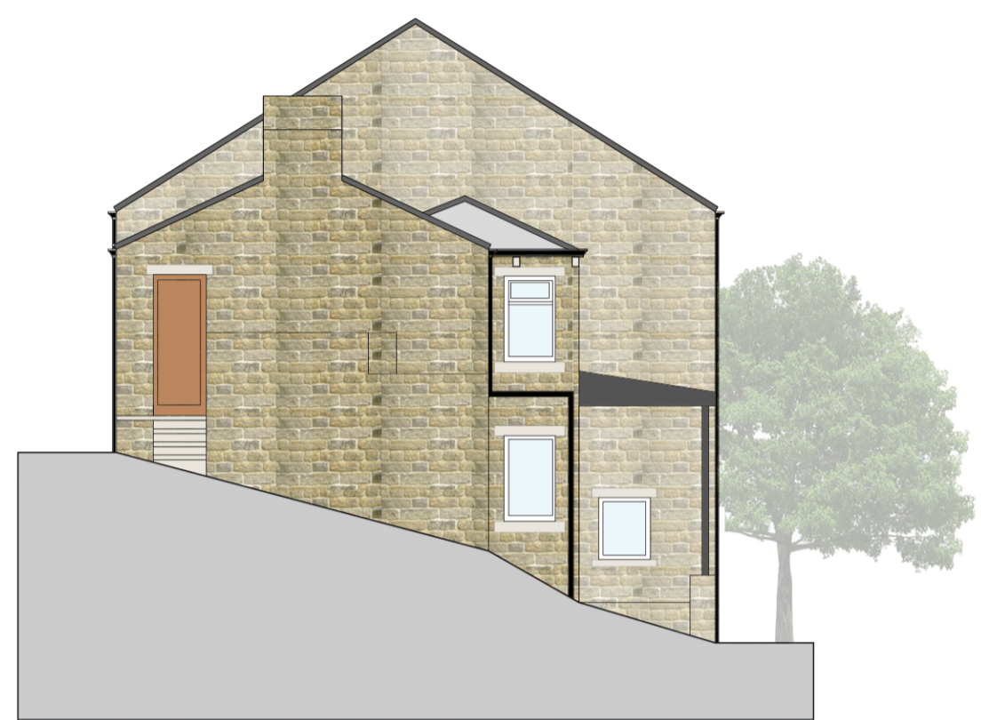
SIDE (SOUTH) ELEVATION_ AS EXISTING Scale 1:100