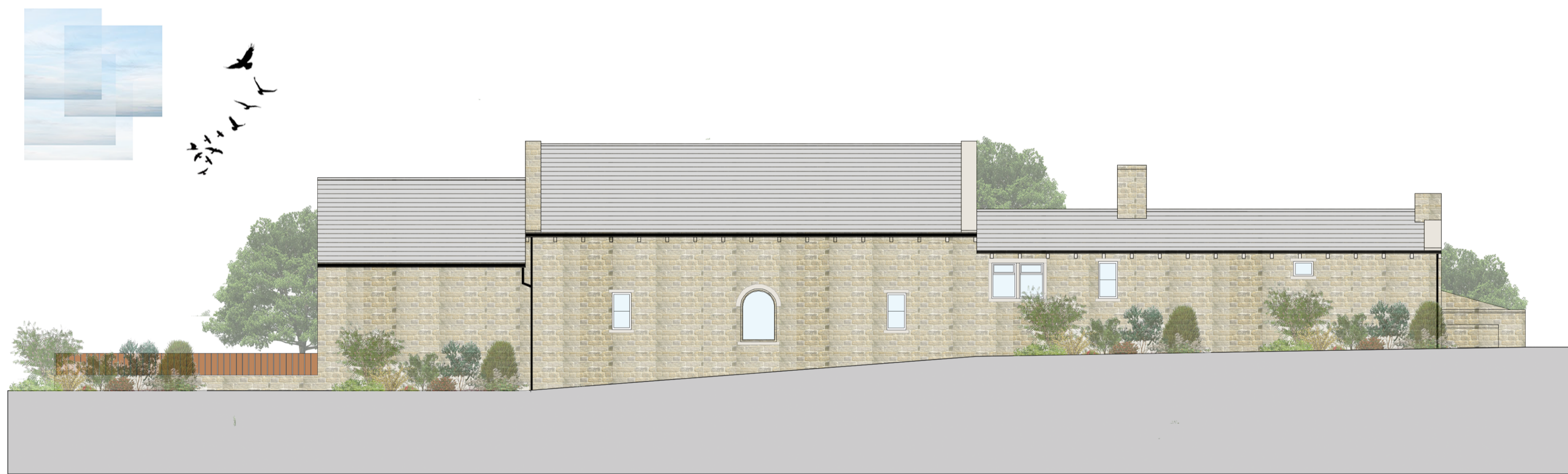
REAR (WEST) ELEVATION_ AS EXISTING Scale 1:100