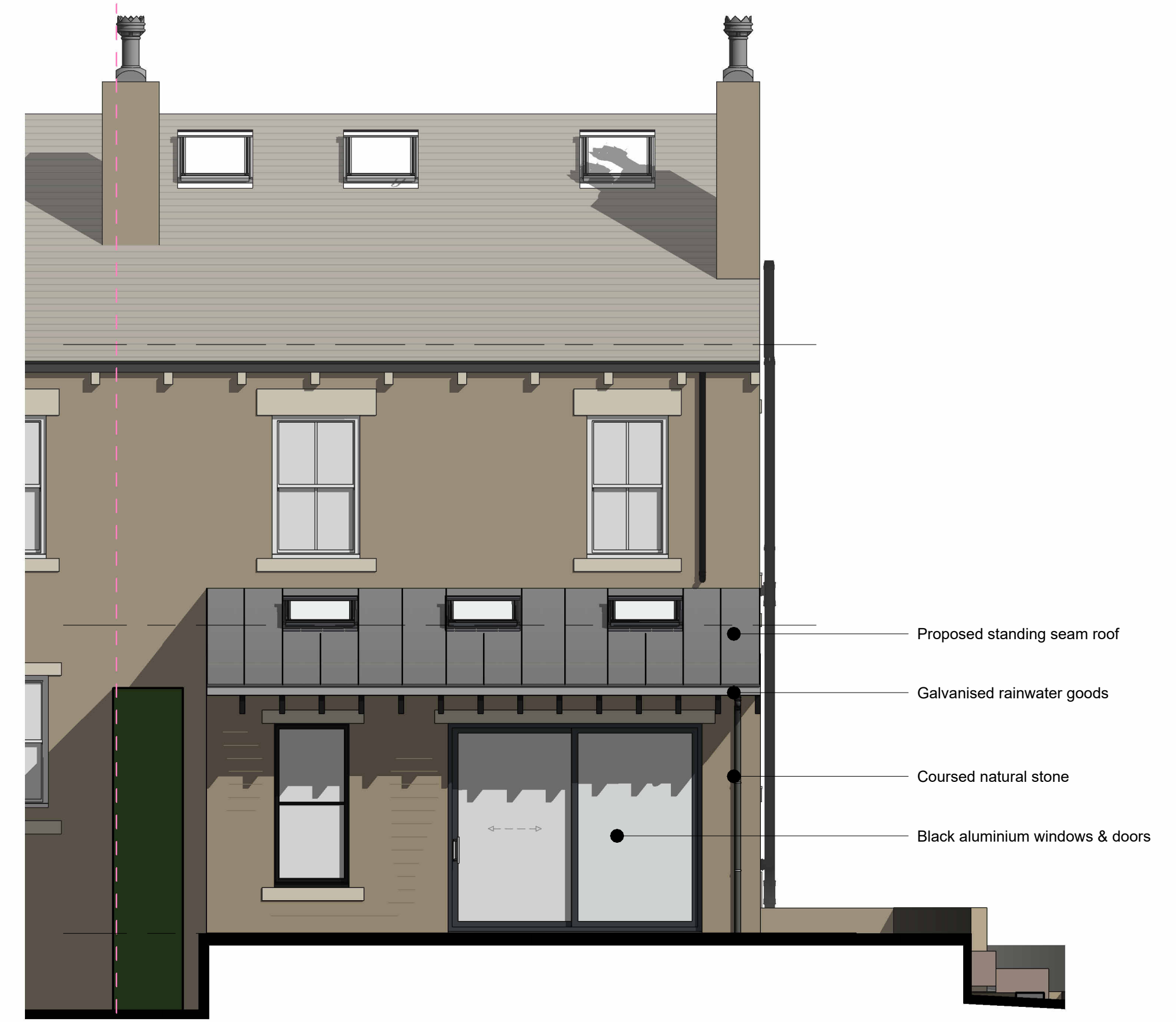
PROPOSED REAR ELEVATION (SOUTH-EAST)

Nb. south west elevation is same but handed.