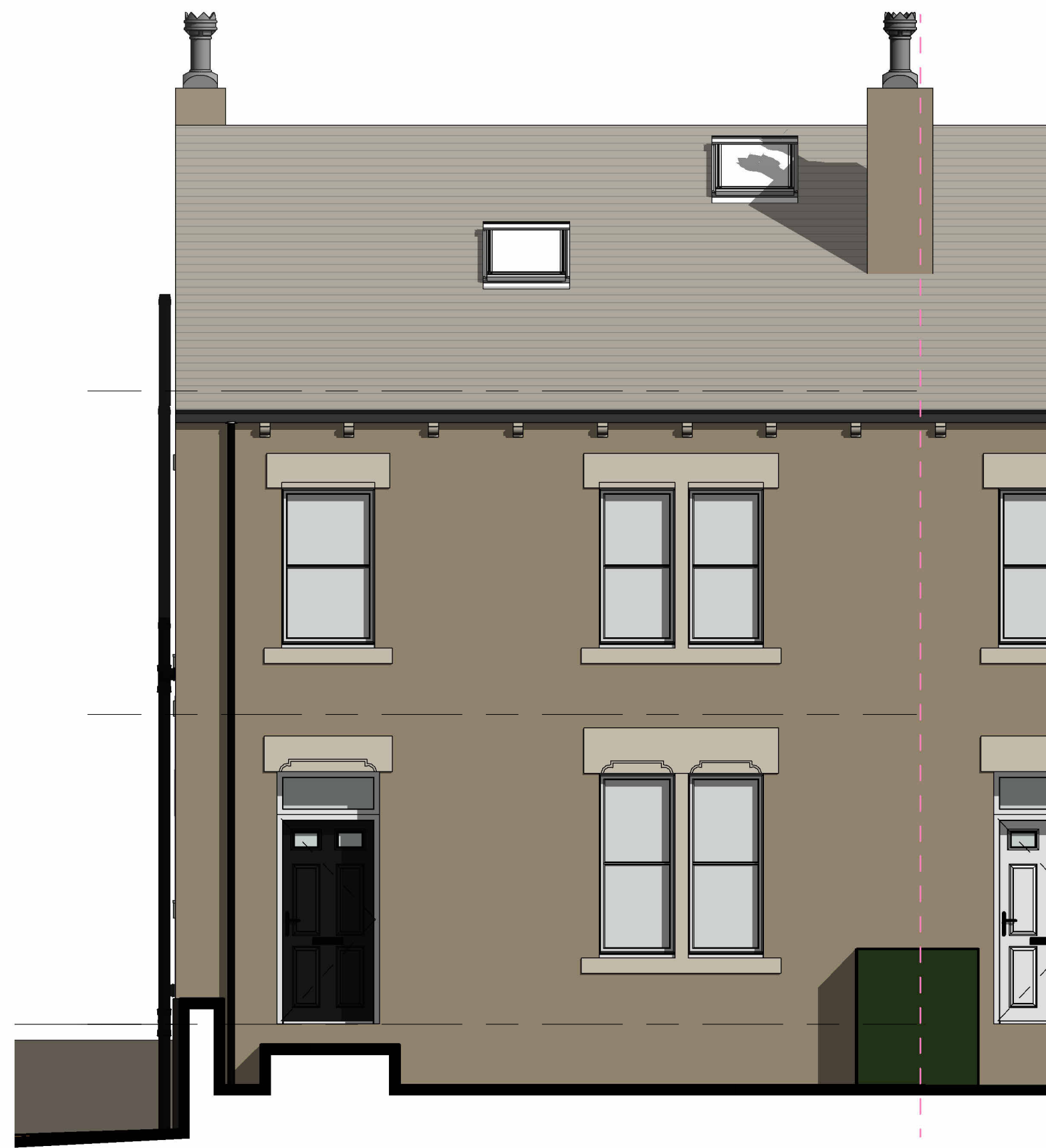
PROPOSED FRONT ELEVATION (UNCHANGED) (NORTH-WEST)