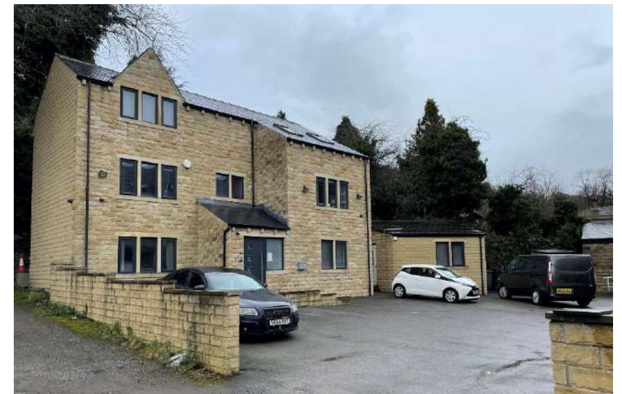
More modern 3-storey residential buildings to the west of the site