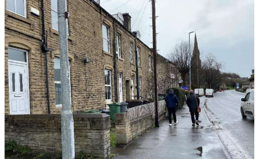
2-storey Victorian terraced houses adjacent to the west of the site

The Official List entries from Historic England of the Listed Buildings in the vicinity of the site mentioned above, together with their listing descriptions and locations, are included on the following pages.