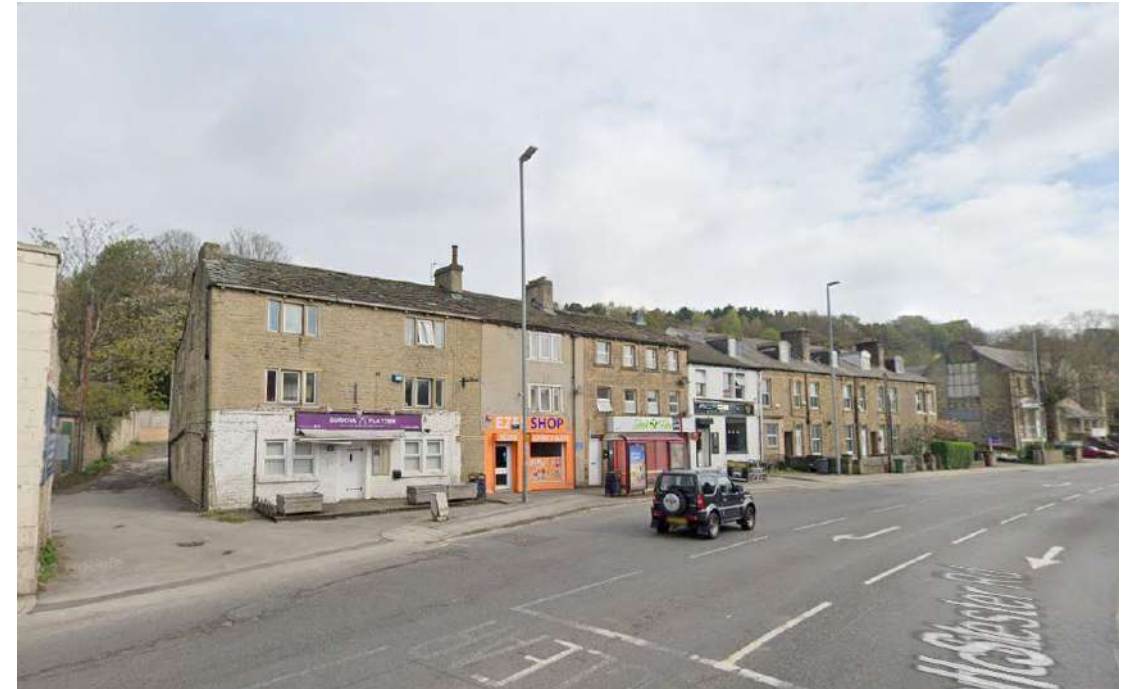
Existing Street View

This is justified by the varying fenestration patterns in the area, and including the recognised variety in the window patterns in these three Listed Buildings on Manchester Road.