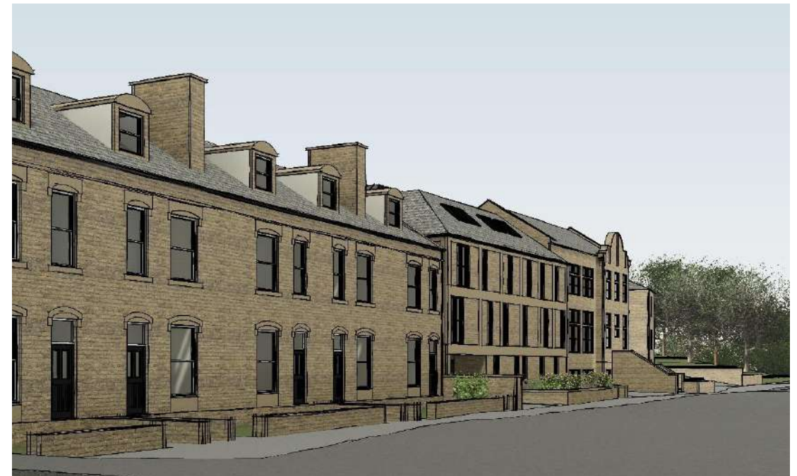
Proposed Street View