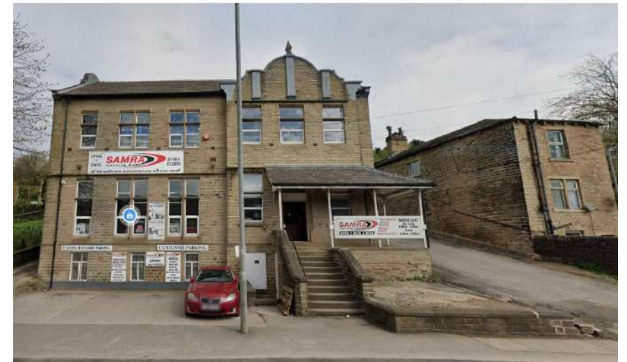
3-storey detached stone building adjacent to the east of the site