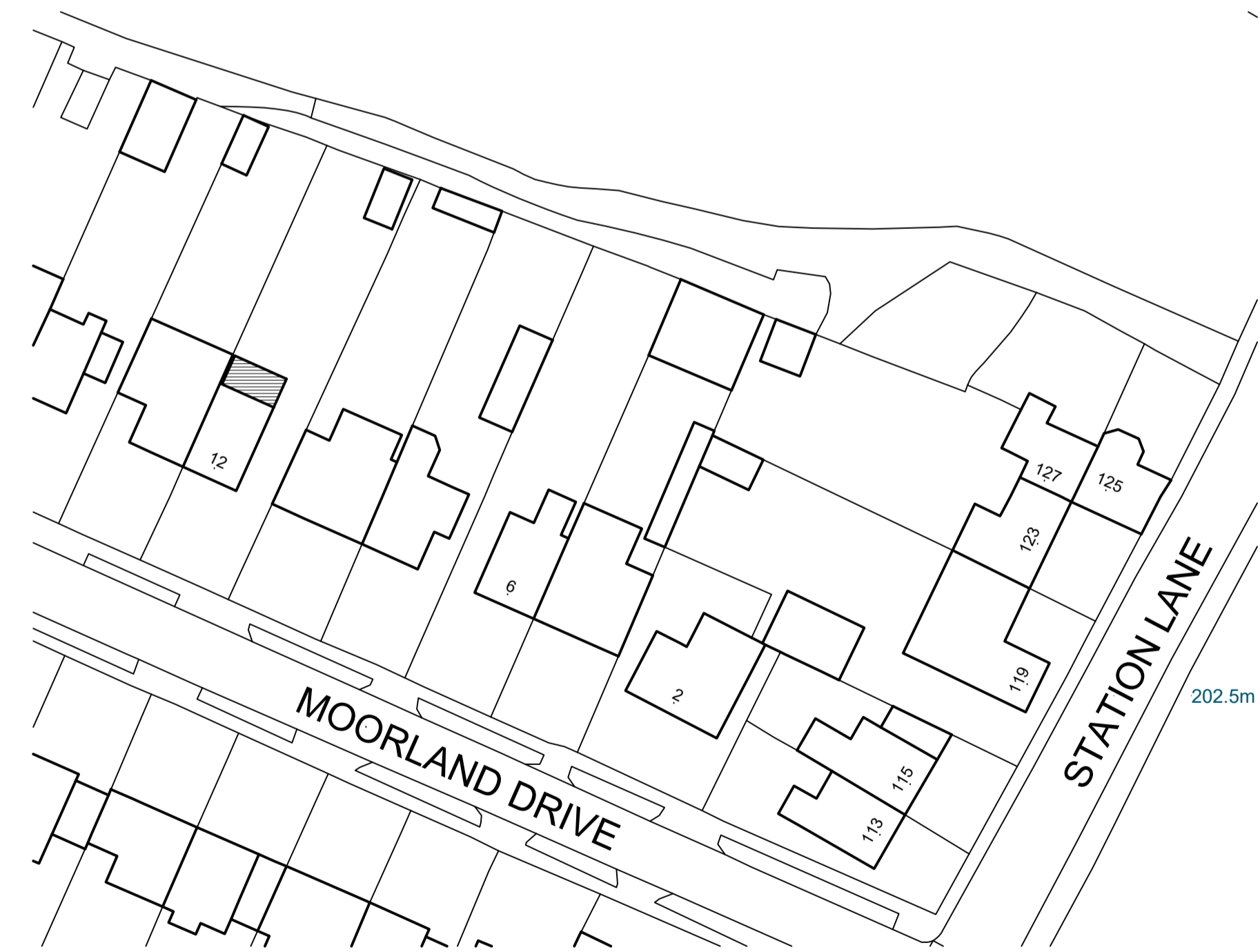
PROPOSED SITE/BLOCK PLAN 1:500

This drawing and its contents are the copyright of Belmont Design and must not be used, reproduced or amended without prior consent from such.