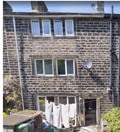
Figure 7: Front elevation at time of application