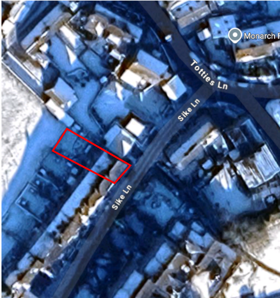
Figure 2: Aerial view of site

1.02. The windows in question are shown highlighted in red in Figures 3 and 4 below.