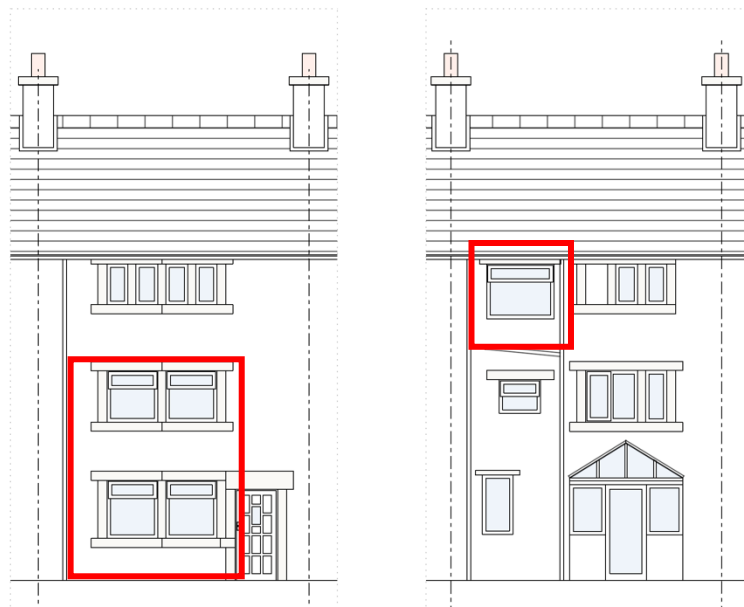
Figure 3: Existing Elevations

1.02. The windows in question are shown highlighted in red in Figures 3 and 4 below.