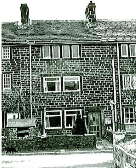
Figure 6: Front elevation at time of listing

2.04. The images below show the replacement of the original windows.