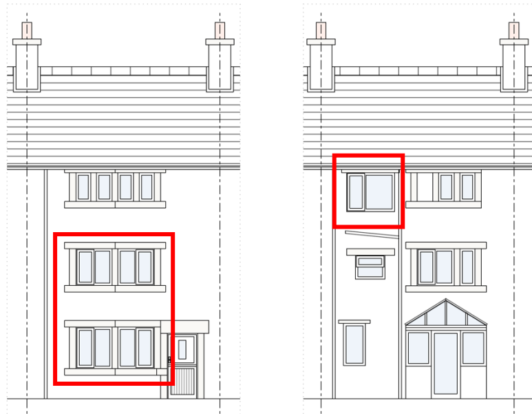
Figure 4: Proposed Elevations