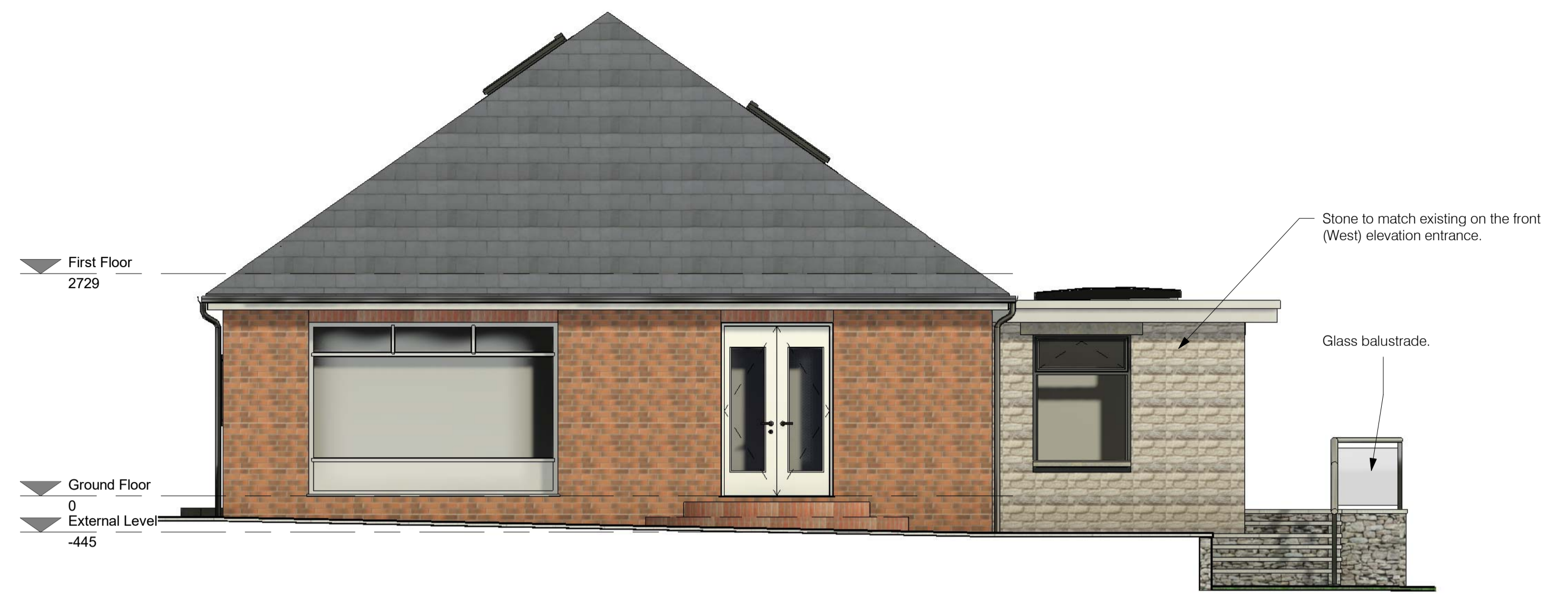
Proposed South Elevation 1 : 50