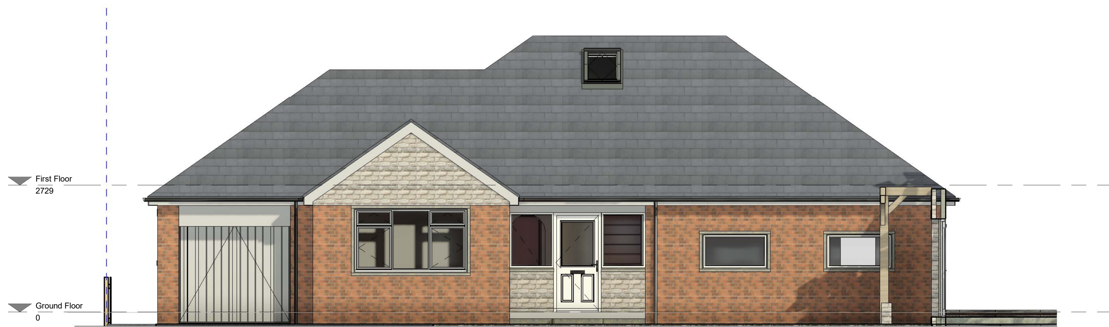
West Elevation 1 : 50

Blue dashed line indicates extent of ownership boundary