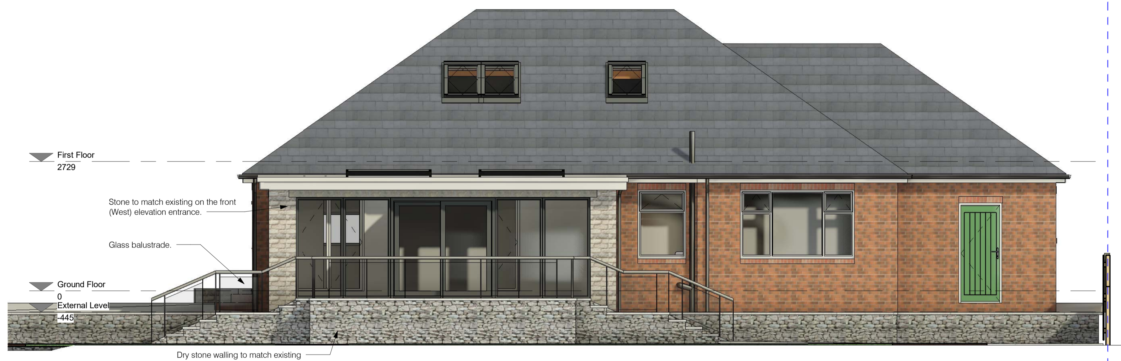
Proposed East Elevation 1 : 50