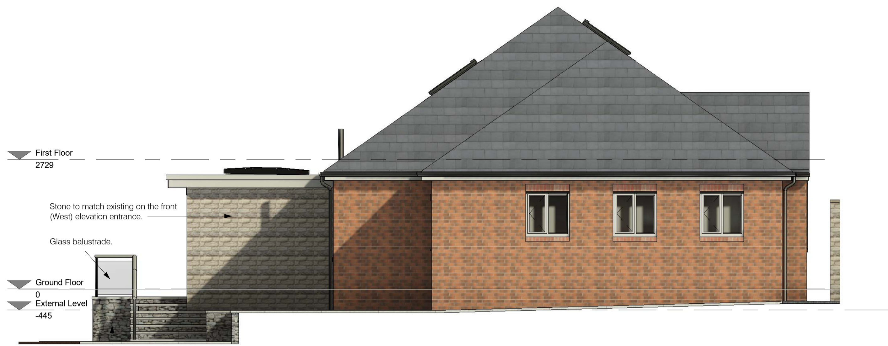
Proposed North Elevation 1 : 50