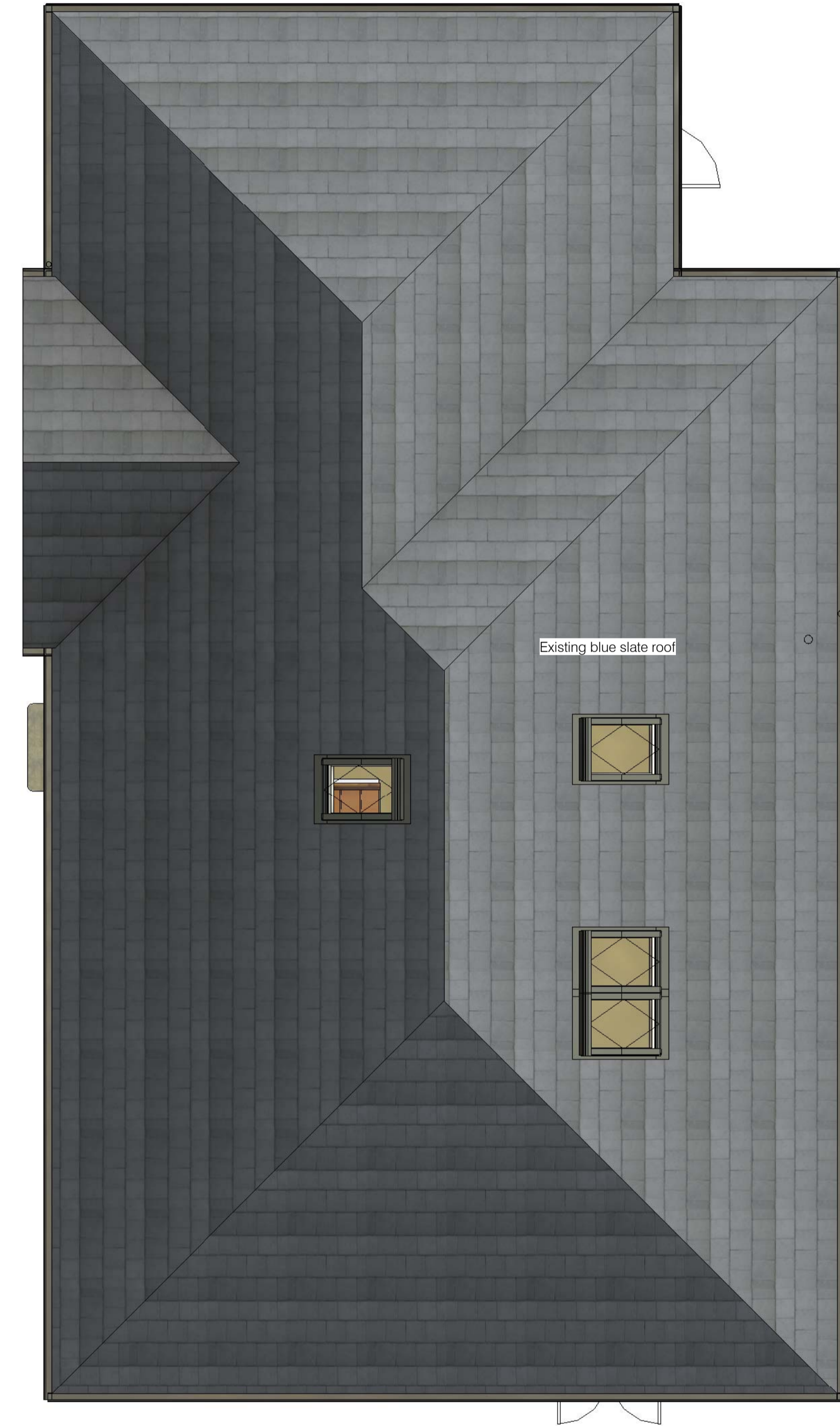
Existing Roof Plan