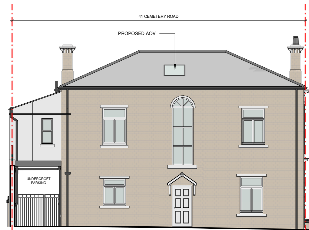
PROPOSED REAR ELEVATION 1:100@A2