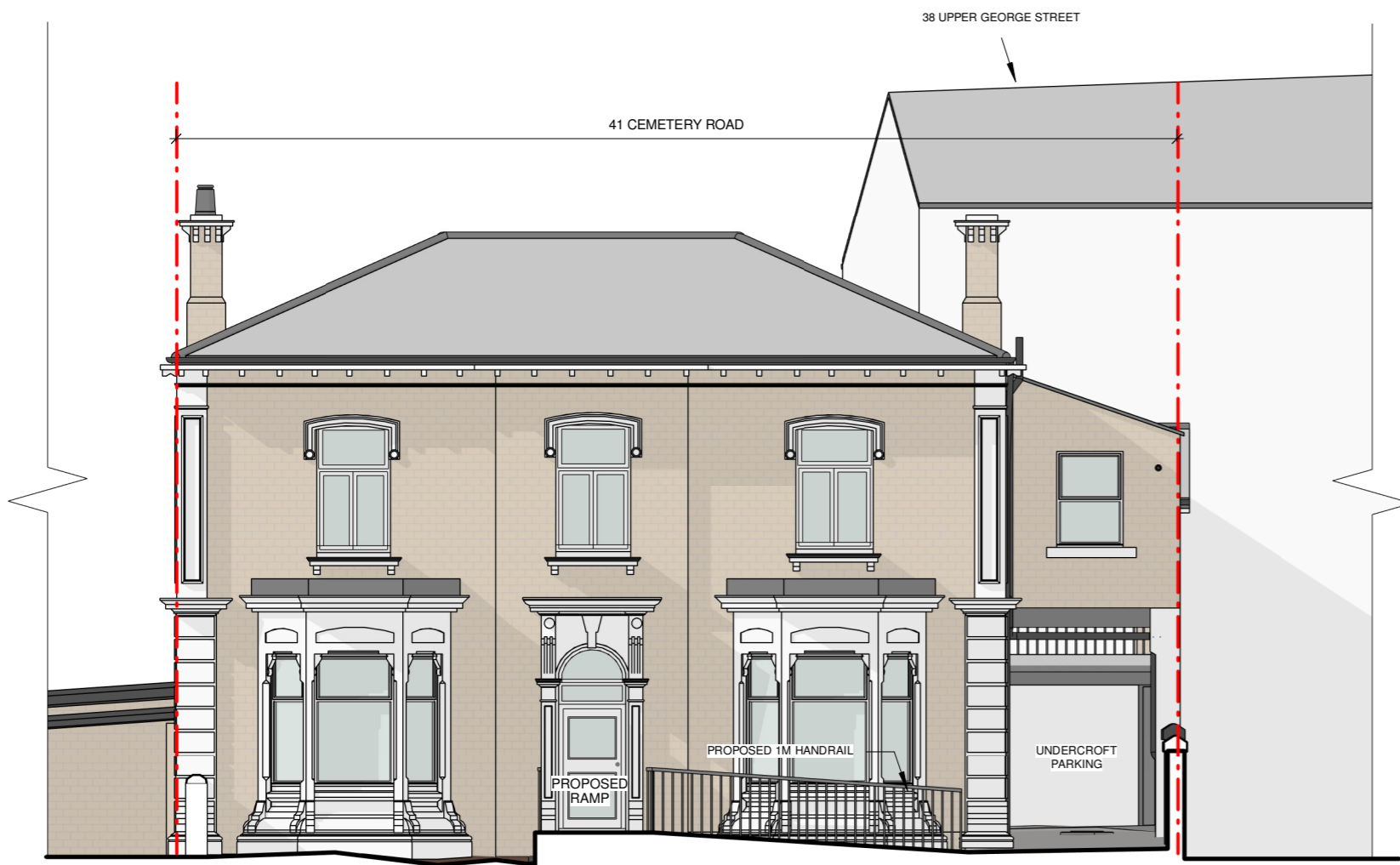
PROPOSED FRONT ELEVATION 1:100@A2