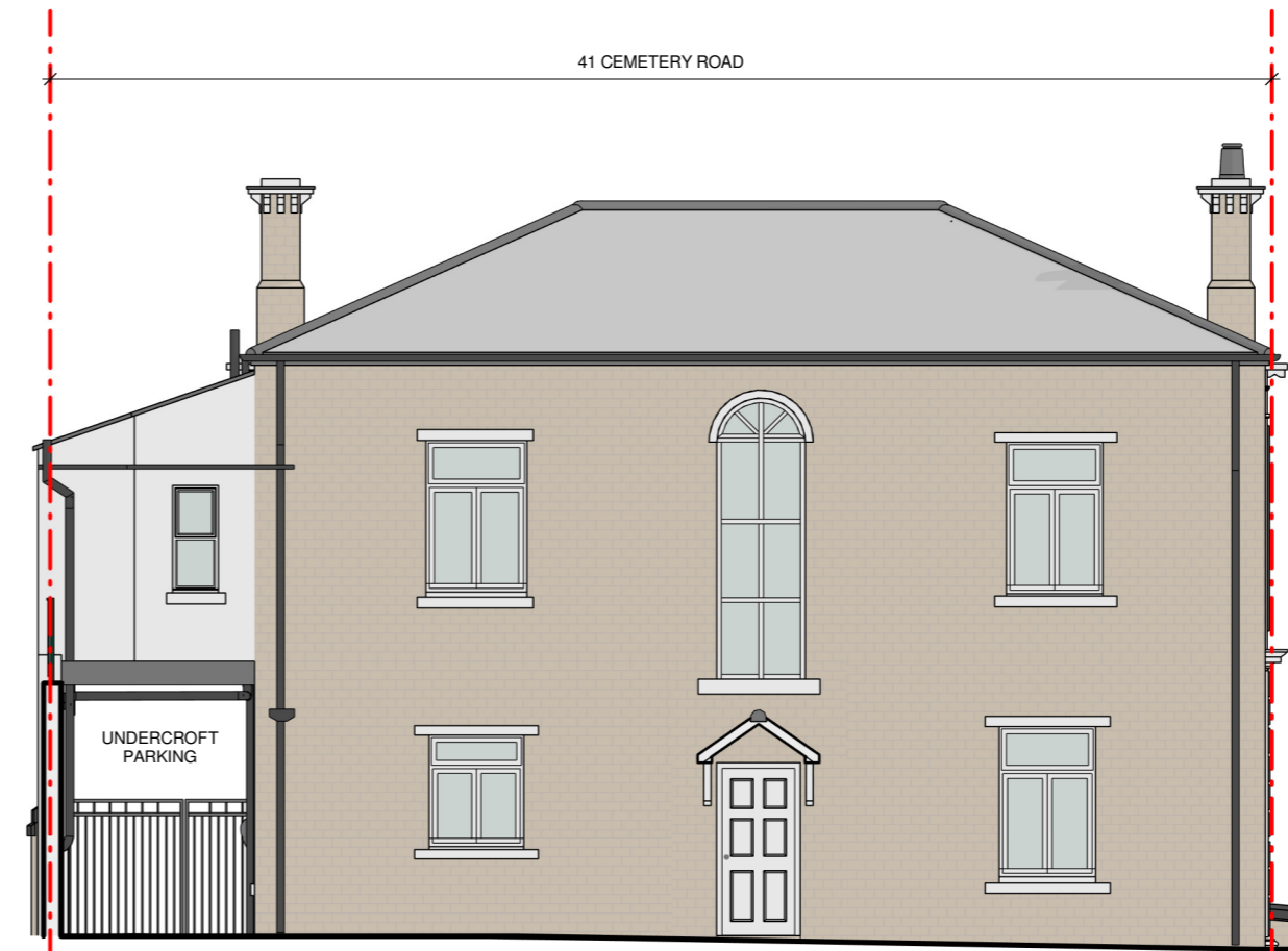
EXISTING REAR ELEVATION 1:100@A2