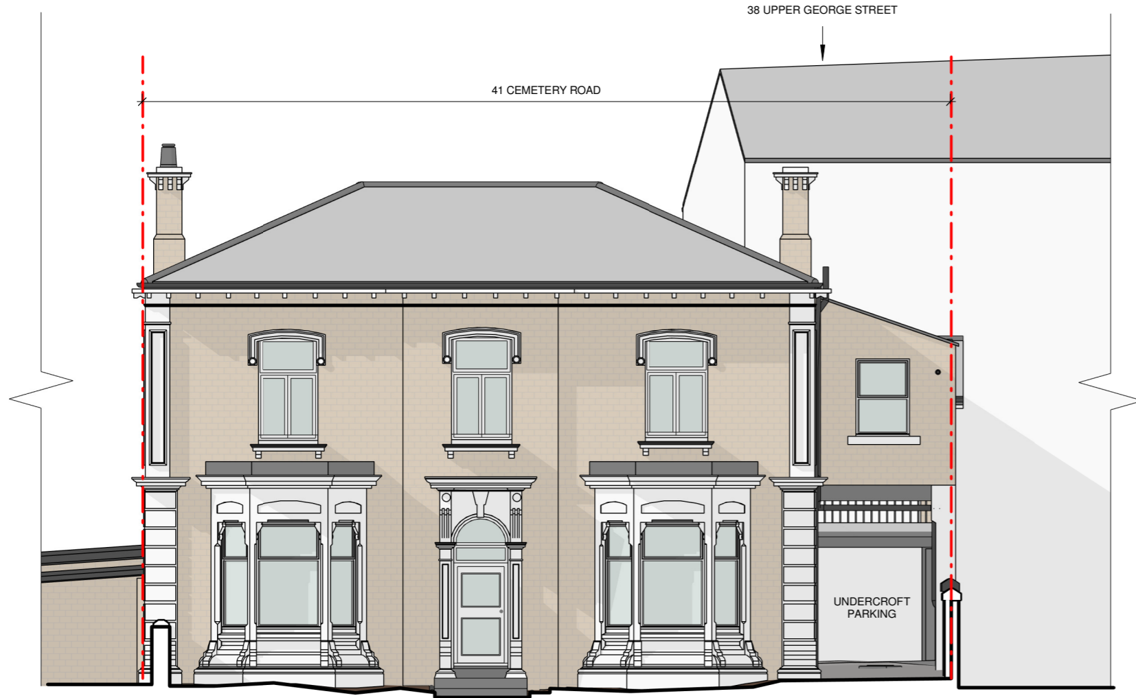
EXISTING FRONT ELEVATION 1:100@A2