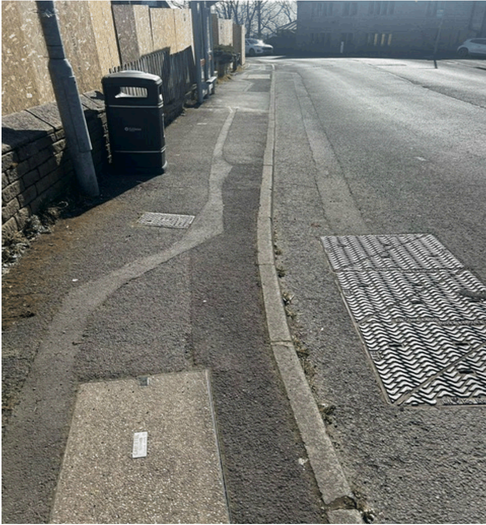
FOOTPATH AND ROADWAY EAST ON KNOWL ROAD.