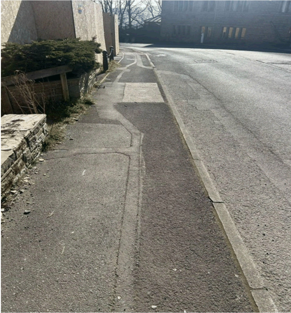
FOOTPATH EAST CLOSE TO NEW ENTRANCE