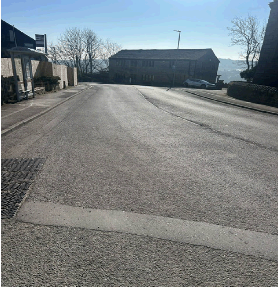
ROADWAY LOOKING EAST TO KNOWL ROAD