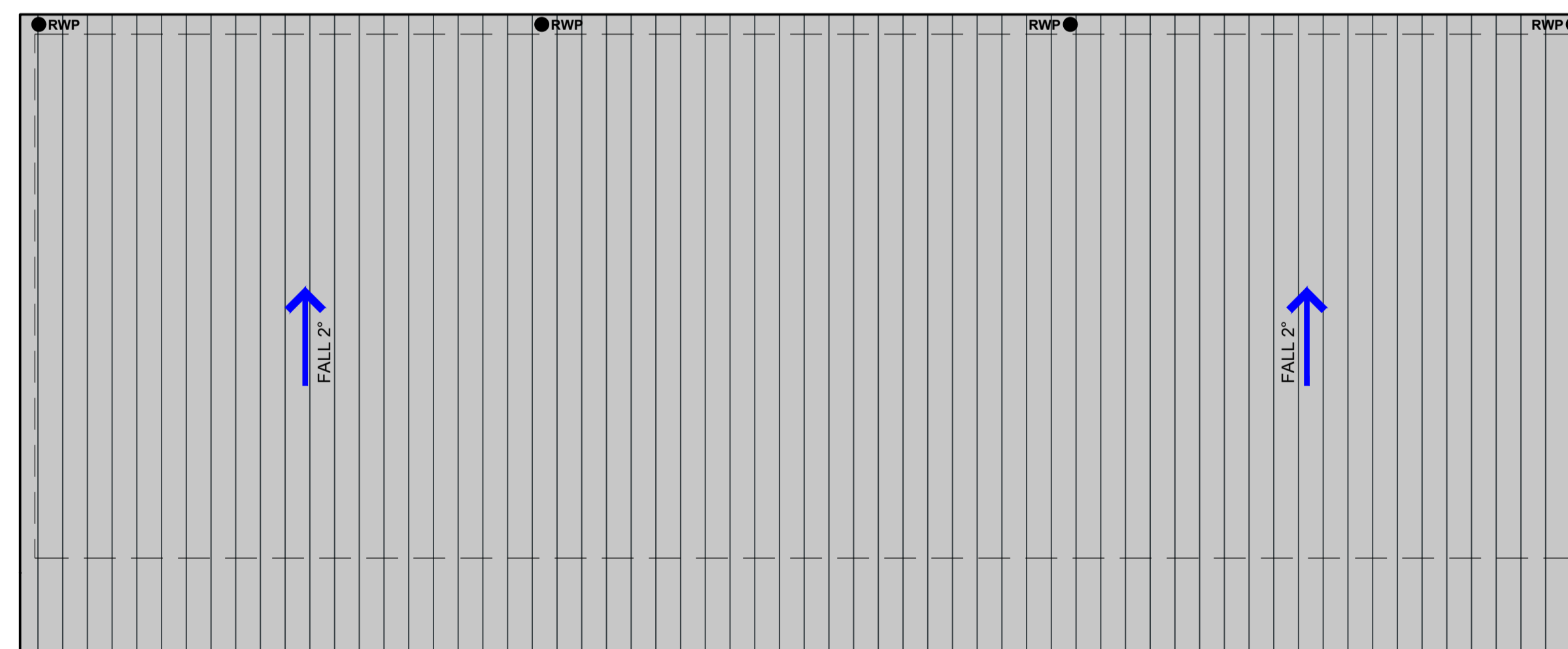
UNITS - ROOF LAYOUT