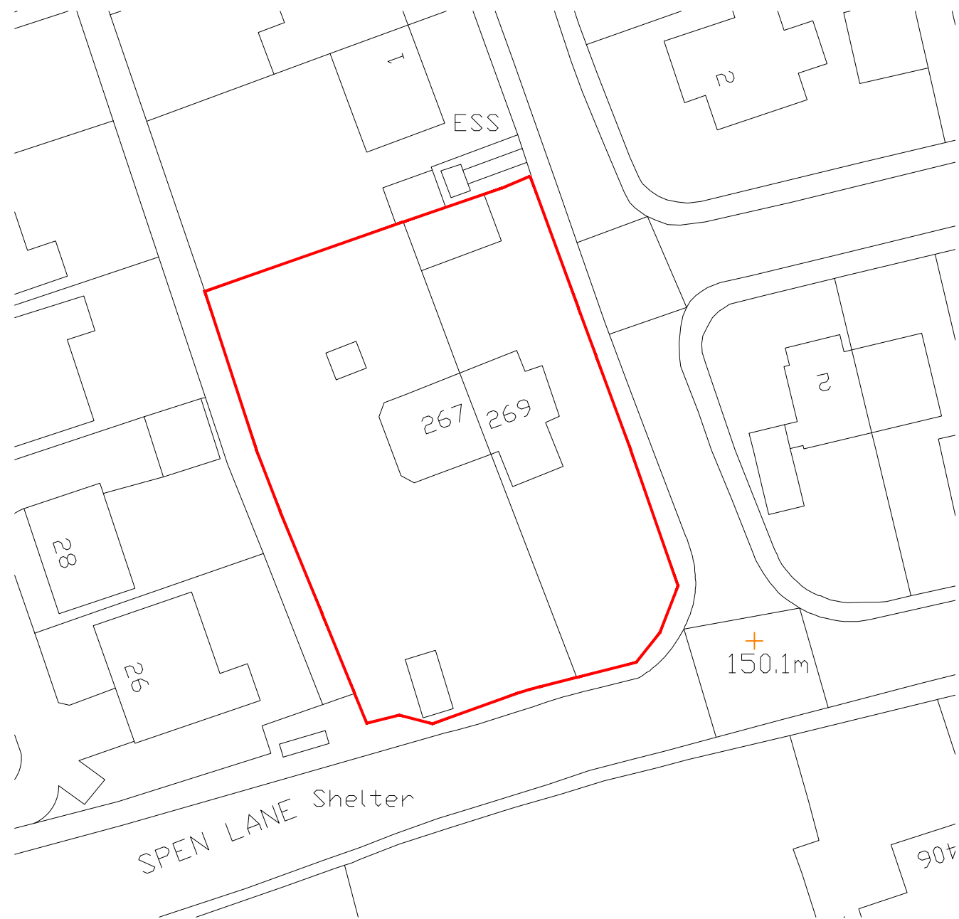
EXISTING BLOCK PLAN 1:500