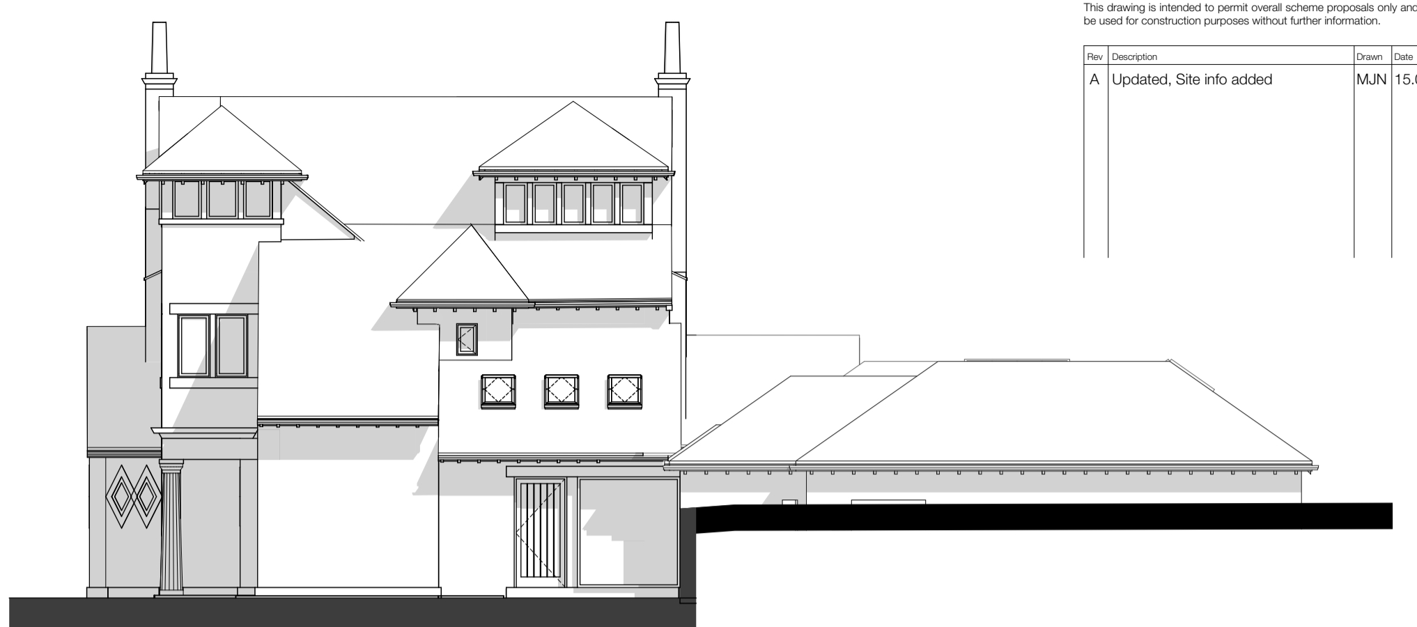
North Elevation - 1:100