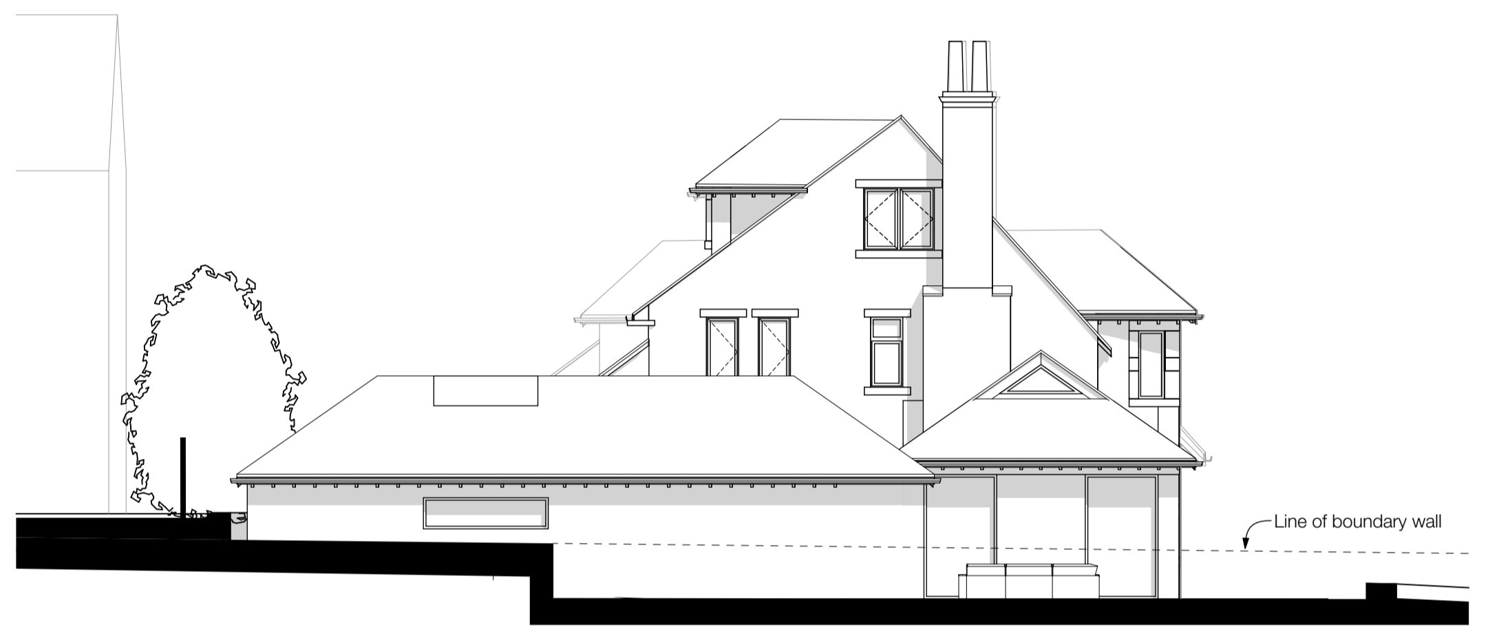
West Elevation - 1:100