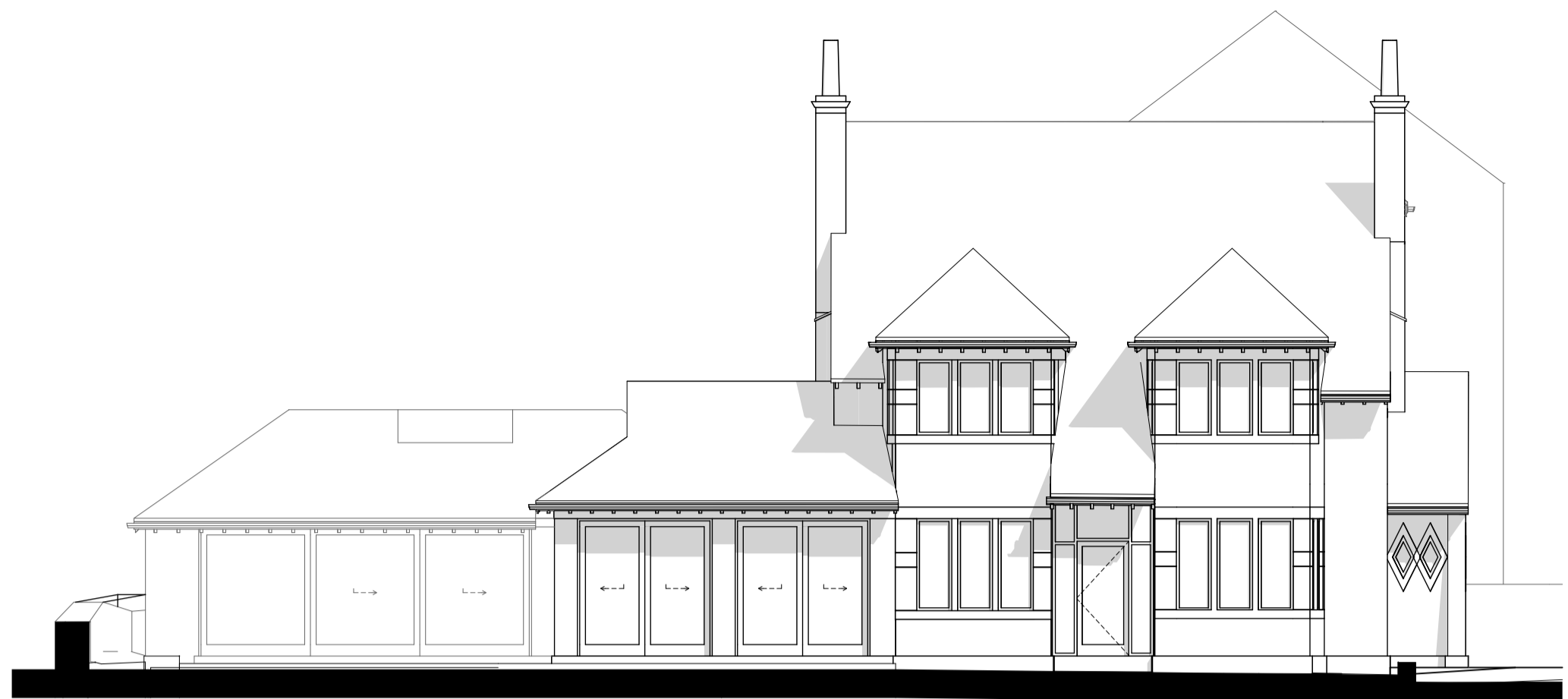
South Elevation - 1:100