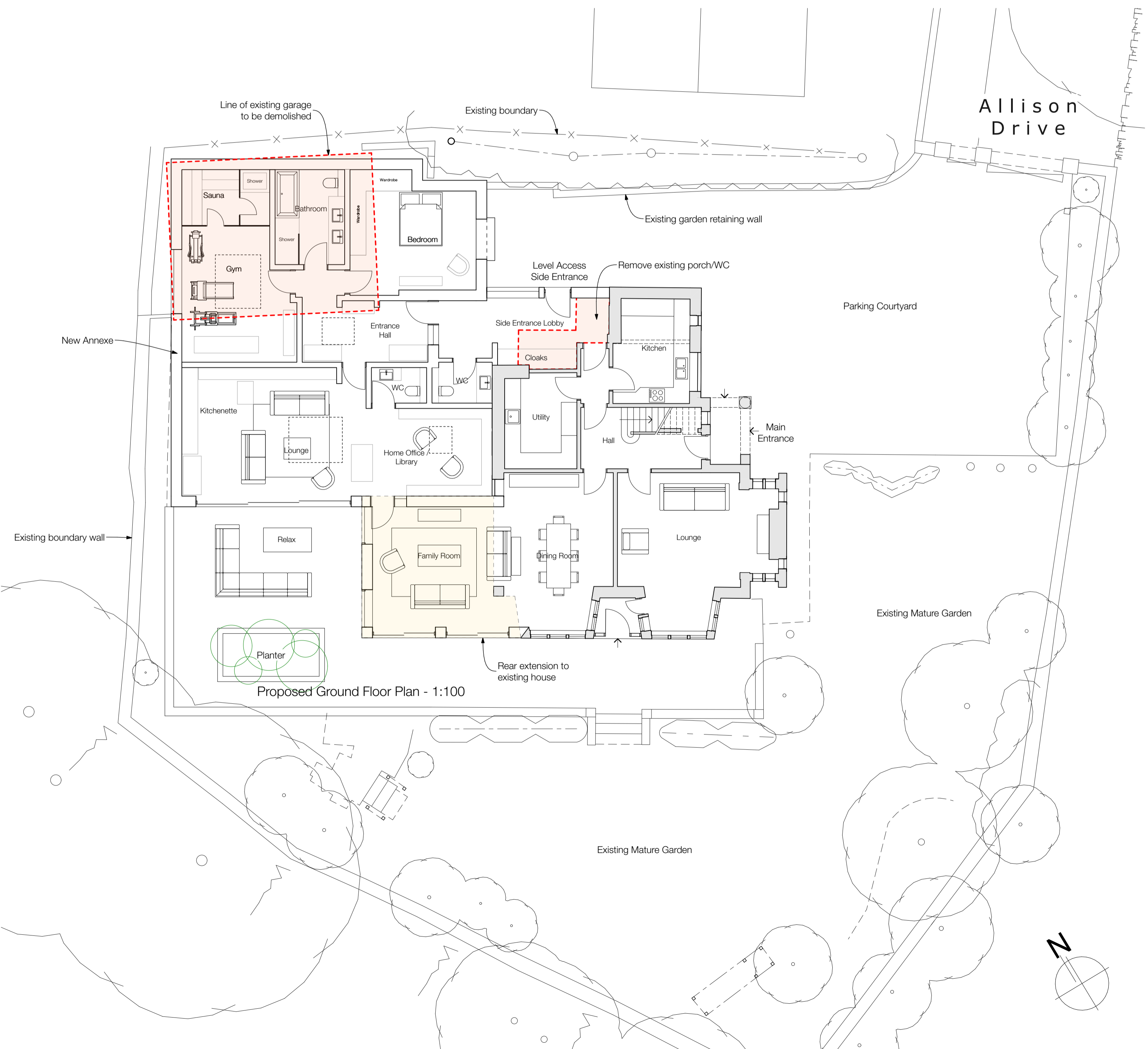
Proposed Ground Floor Plan - 1:100