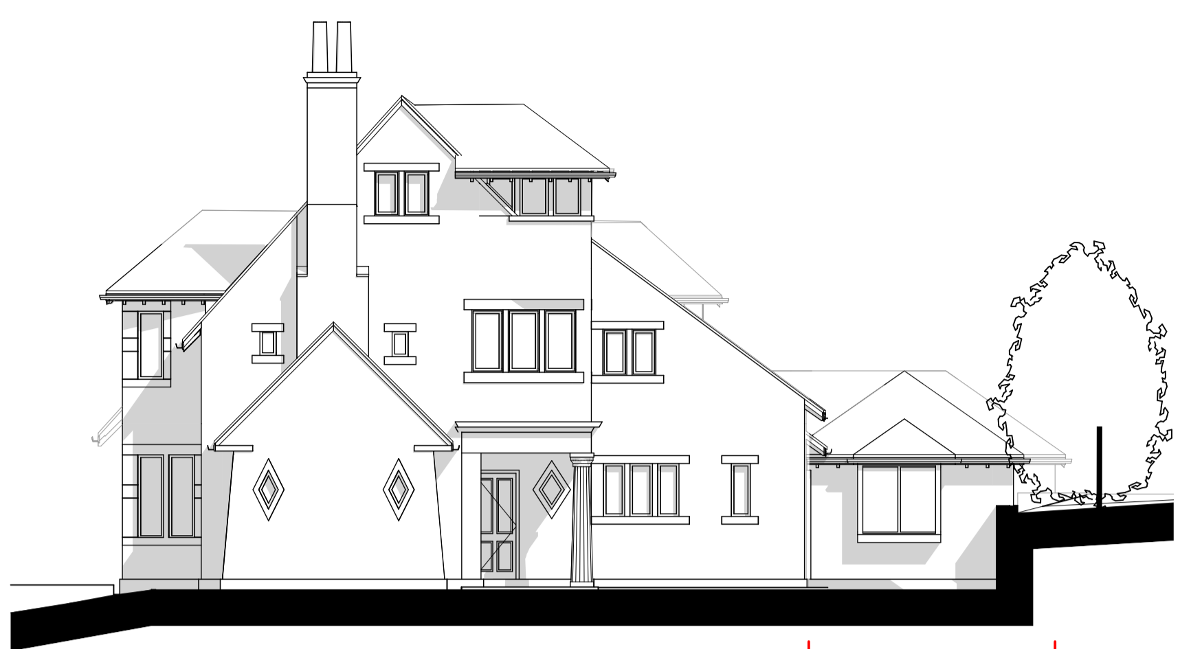
East (Front) Elevation - 1:100