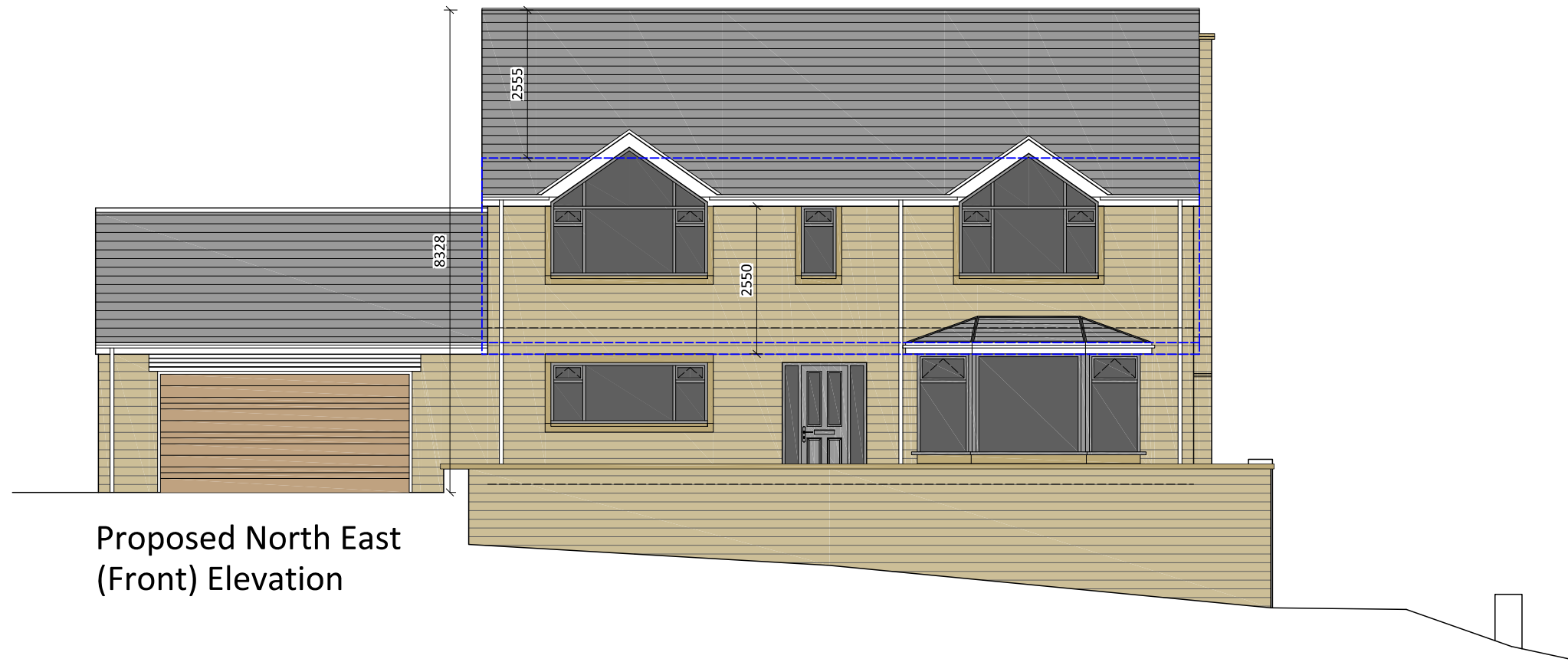
Proposed North East (Front) Elevation