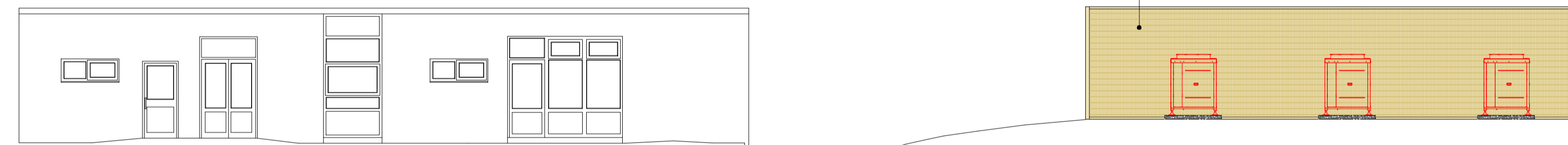
Elevation 1 - As Proposed 1:50