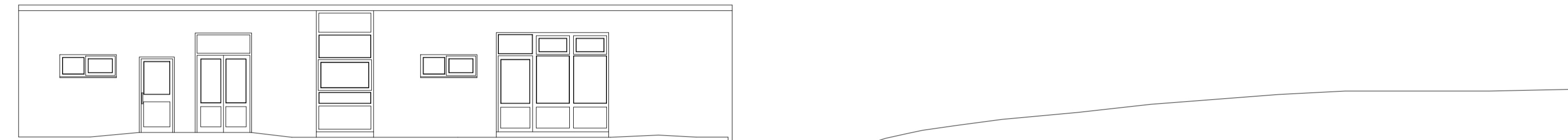
Elevation 1 - As Existing 1:50