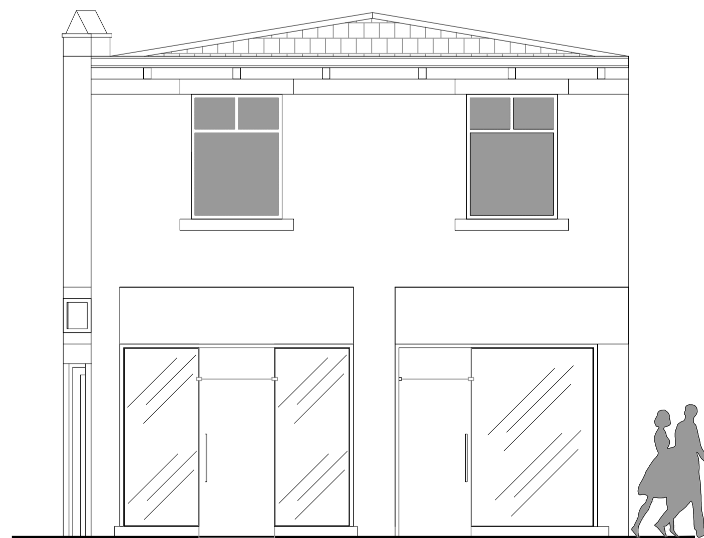
SOUTH ELEVATION AS PROPOSED

DRAWING DESCRIPTION AS PROPOSED PLANS AND ELEVATIONS