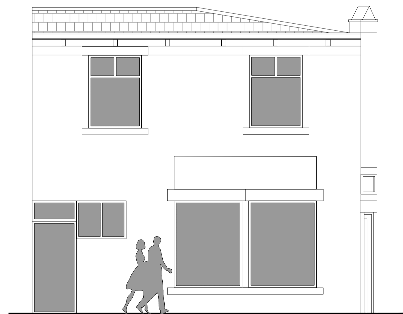
NORTH WEST ELEVATION AS PROPOSED