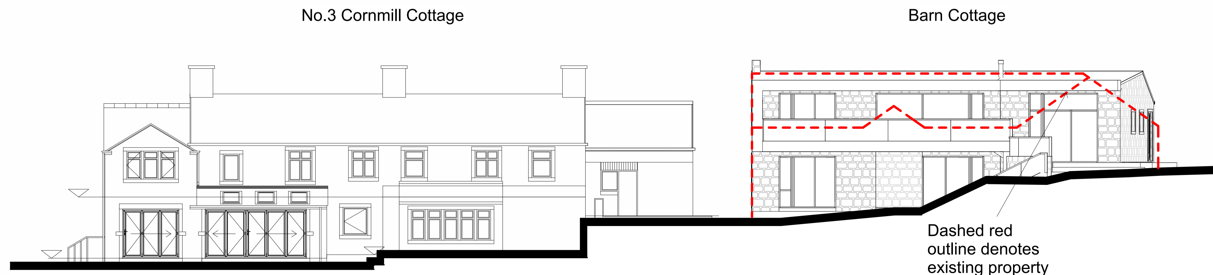
Section 1 1 : 100

Dashed red outline denotes existing property