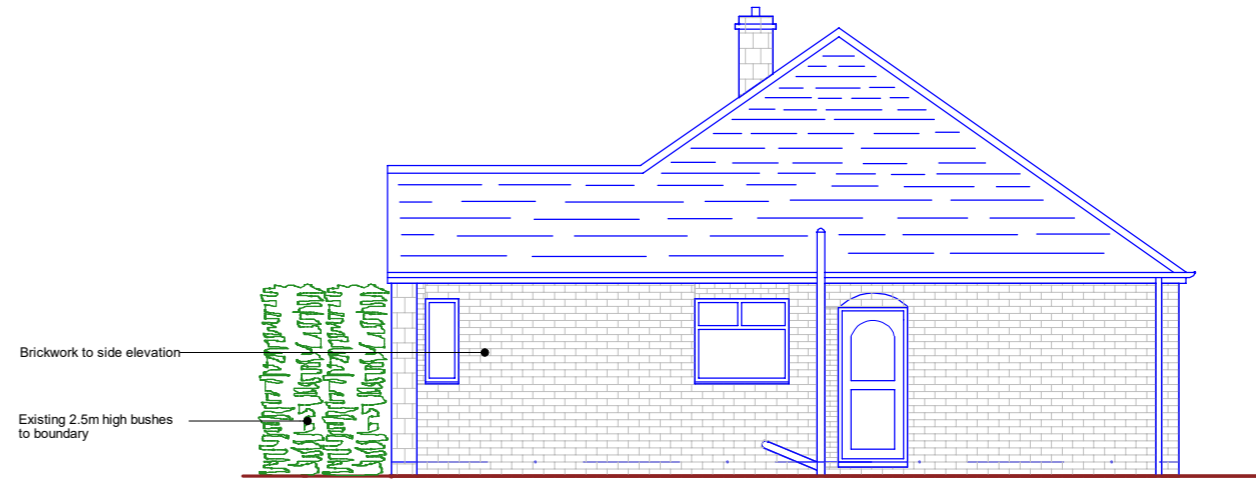
SIDE ELEVATION (North East)