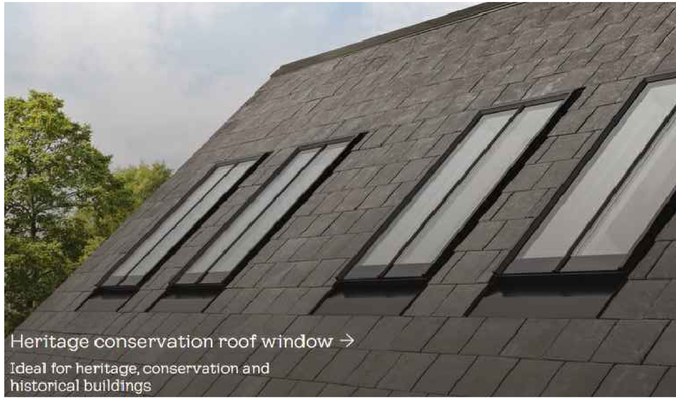
Heritage conservation roof window → Ideal for heritage, conservation and historical buildings