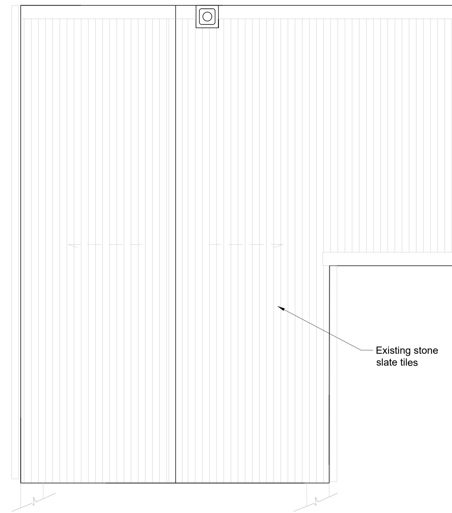
2 EXISTING ROOF PLAN 1:50@A1

Notes All dimensions to be site checked by contractor prior to the commencement of works. Drawings are to be used for the purposes shown in the 'status' only.