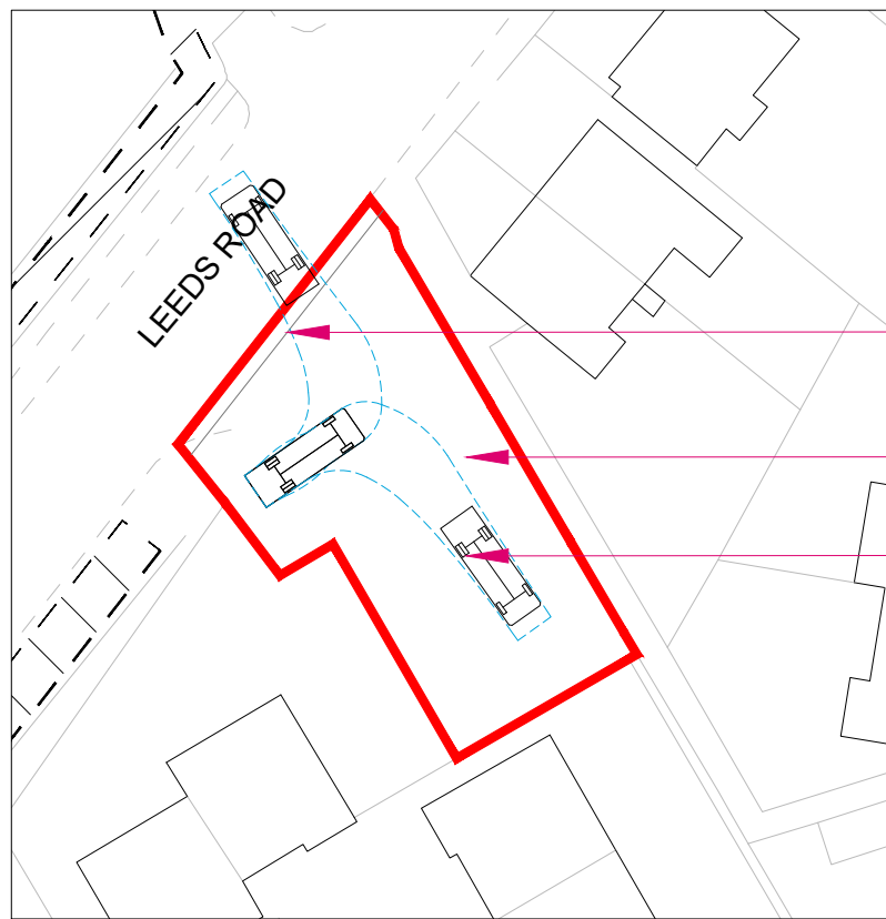
EXISTING SITE PLAN 1:500@A3