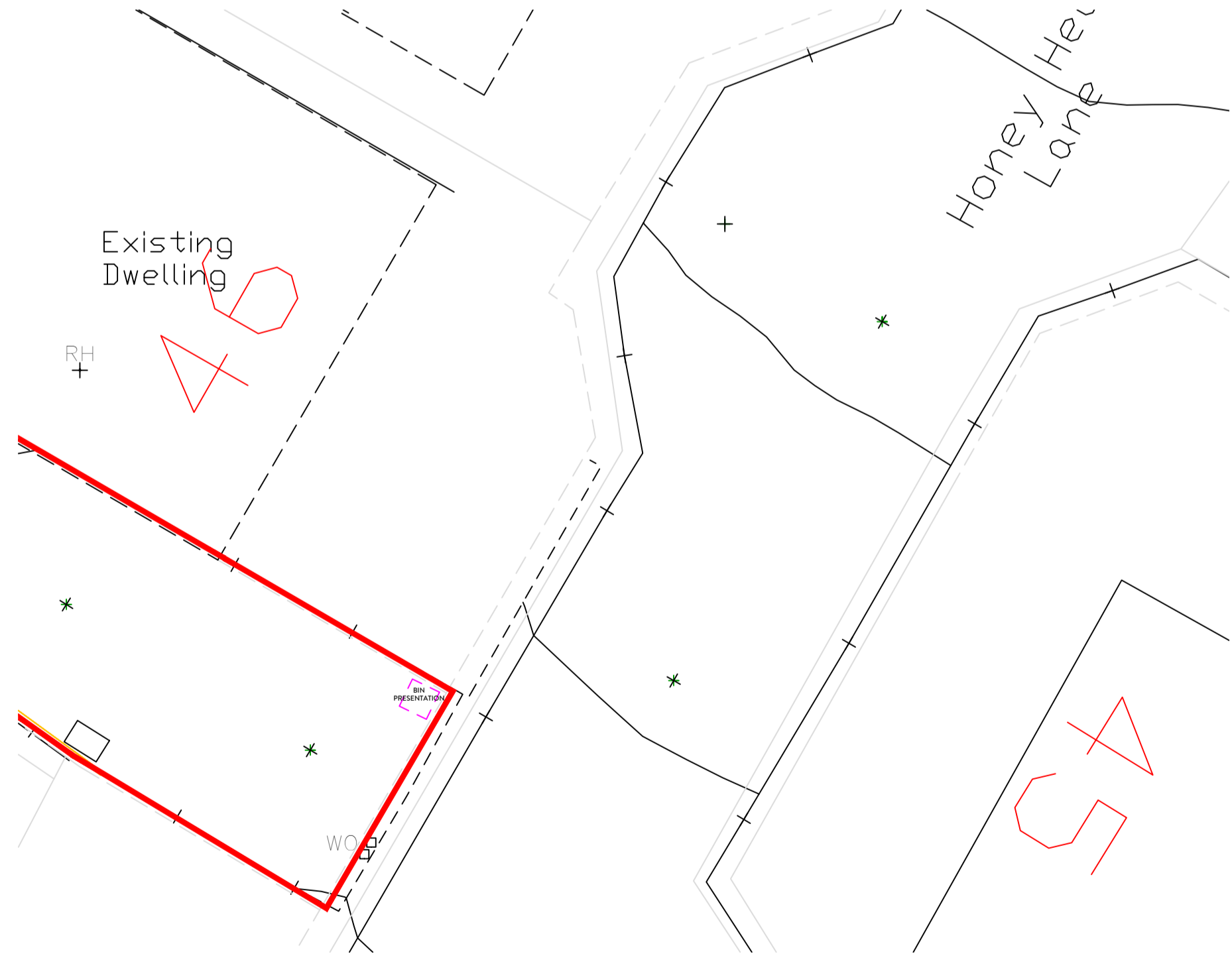
PLOT TWO BIN COLLECTION. 1:100