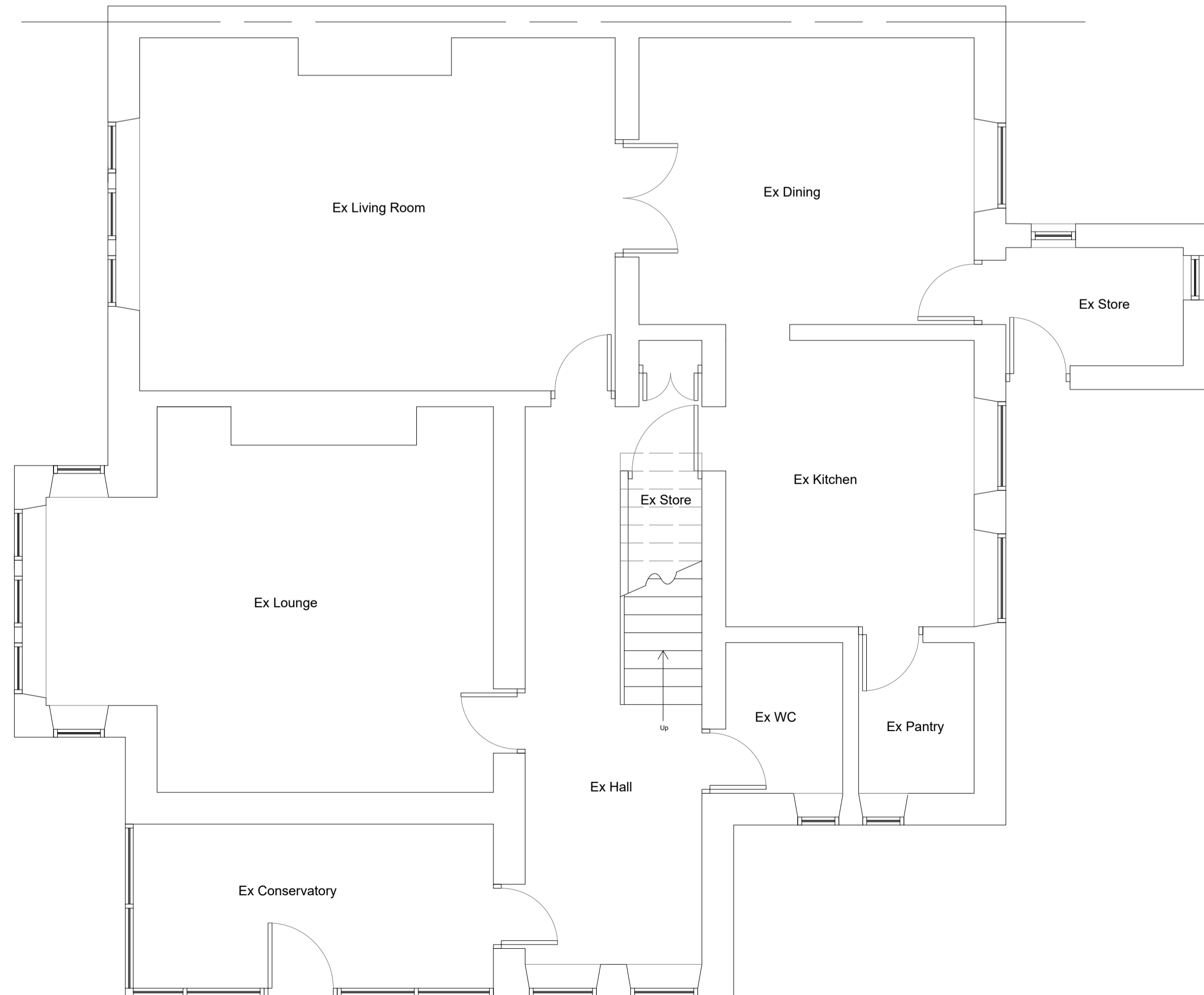
Ground Floor 1:50