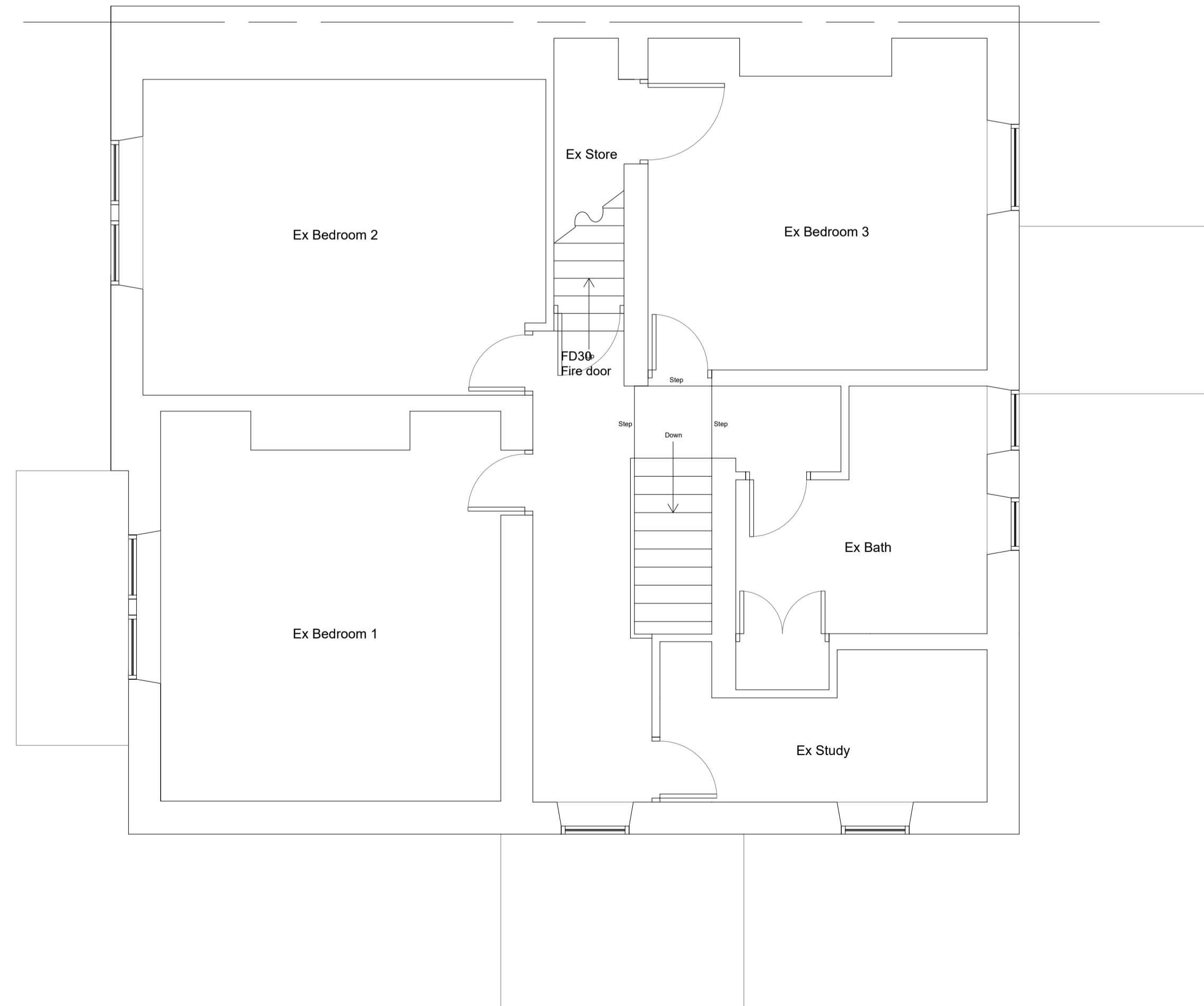
First Floor 1:50