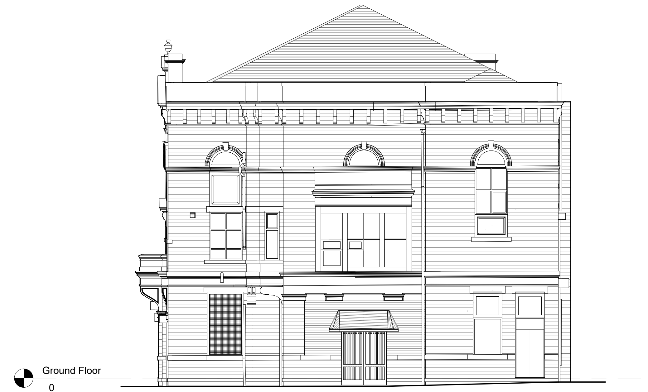
West Elevation - Existing