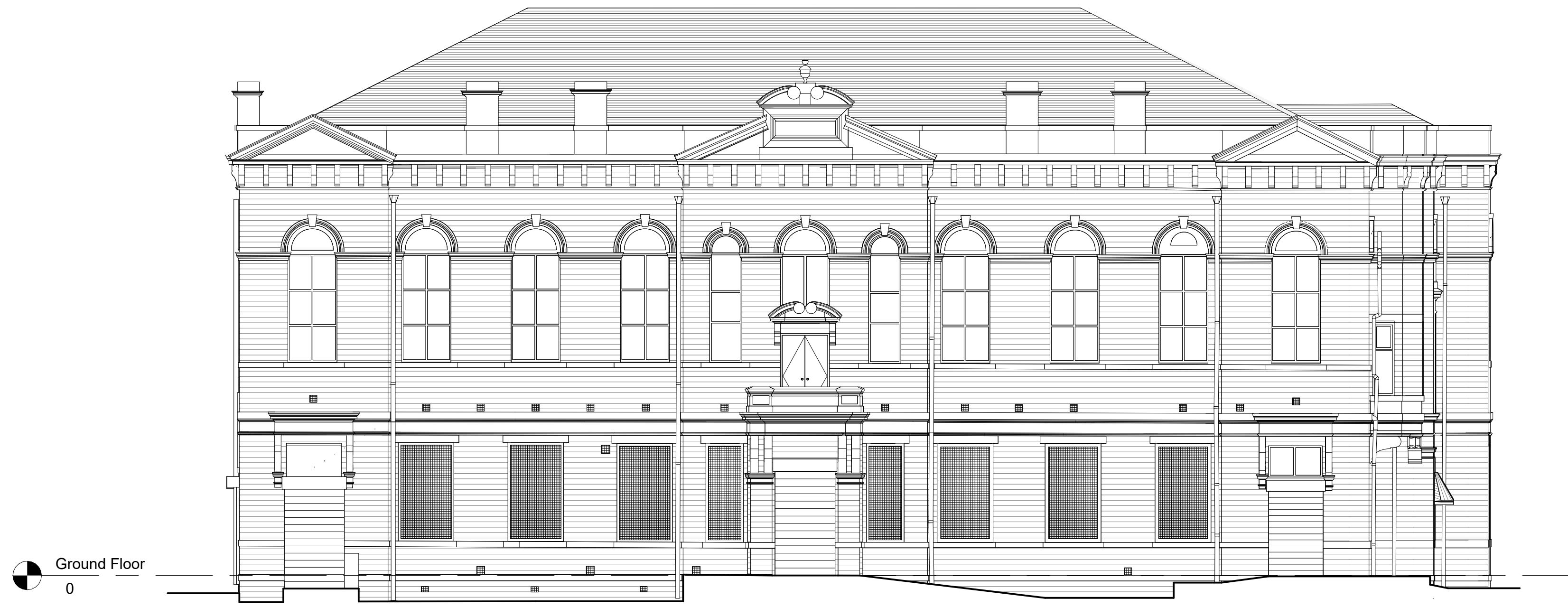
North Elevation - Existing