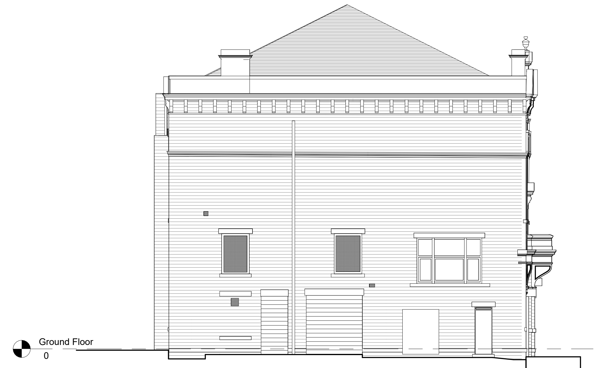
East Elevation - Existing