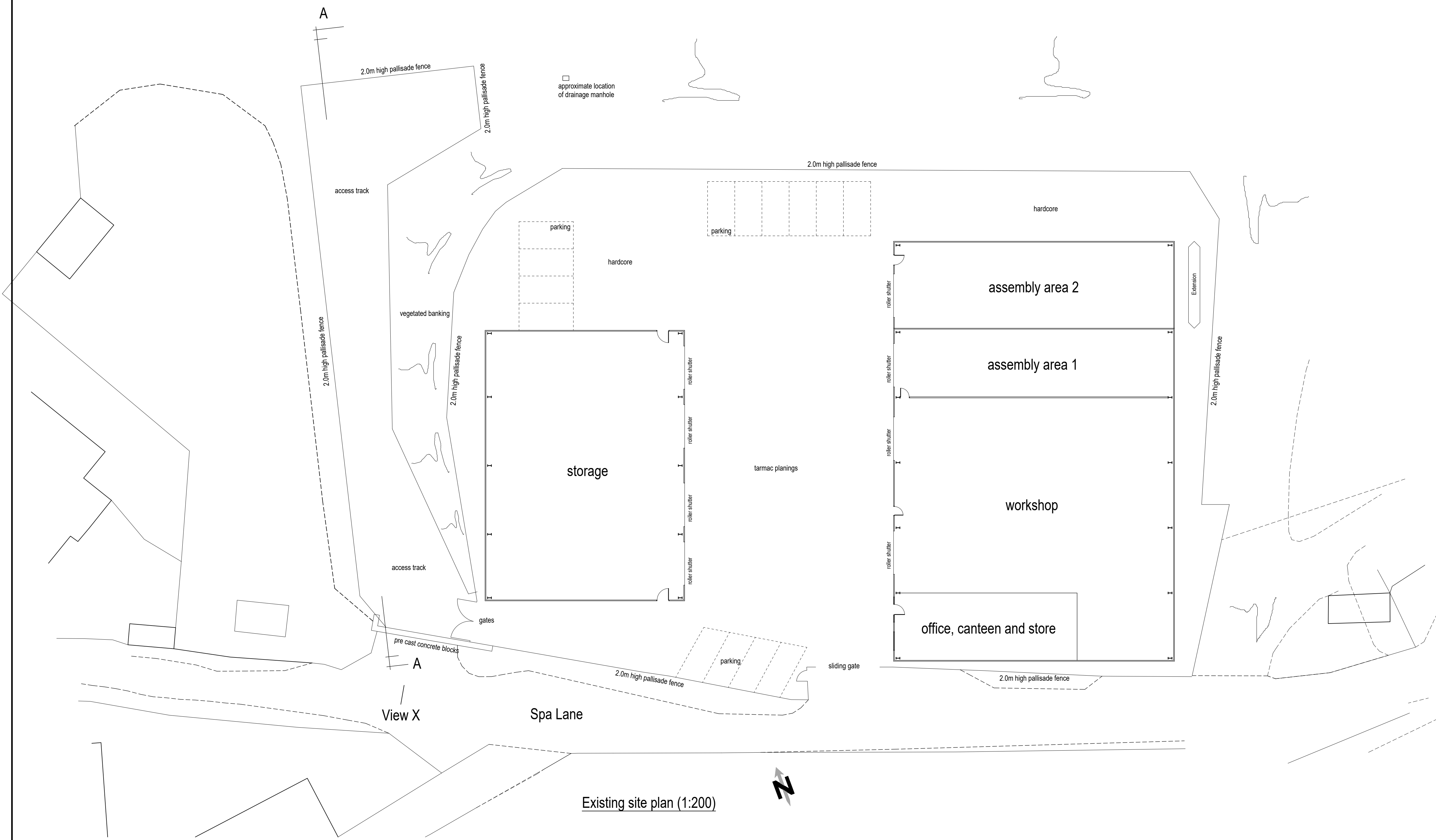
Existing site plan (1:200)

Rev A 07/03/2025 Height of concrete blocks added.