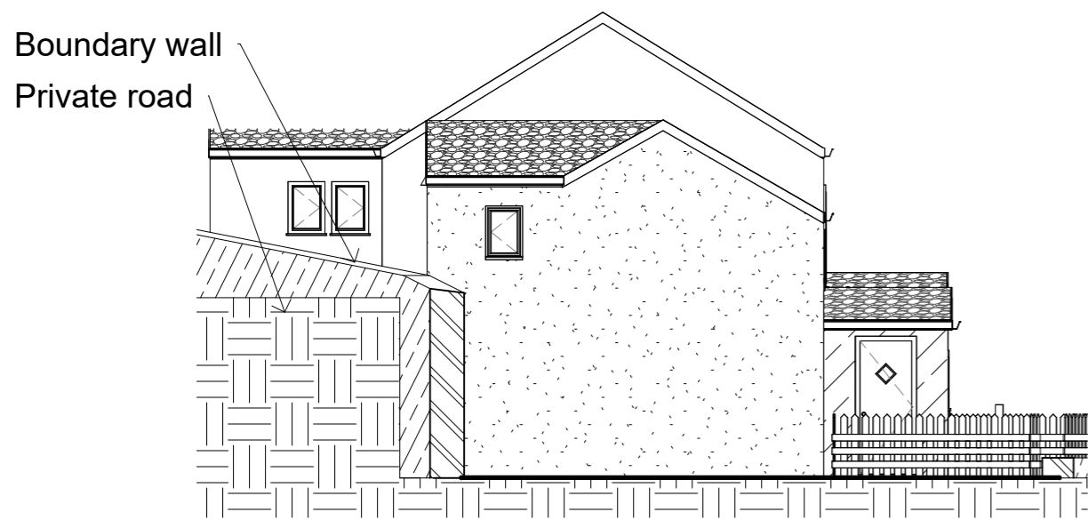
1 North 1 : 100