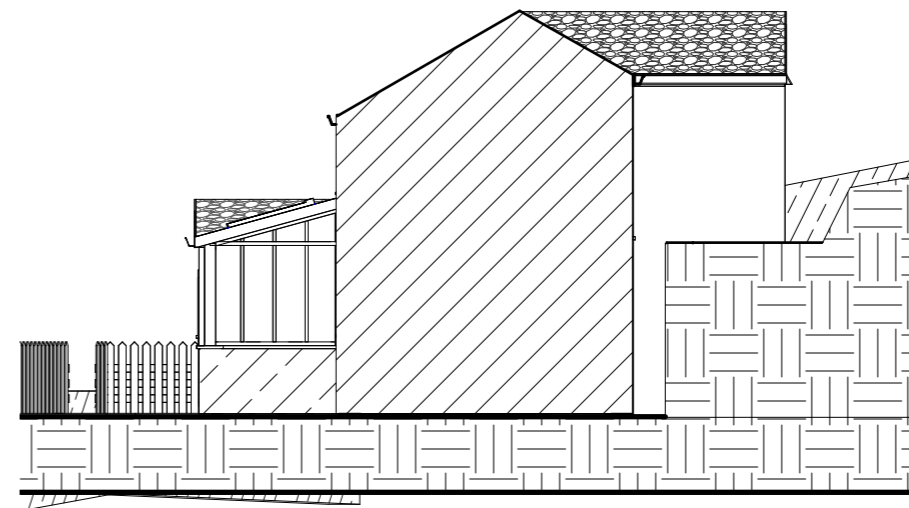
2 South 1 : 100