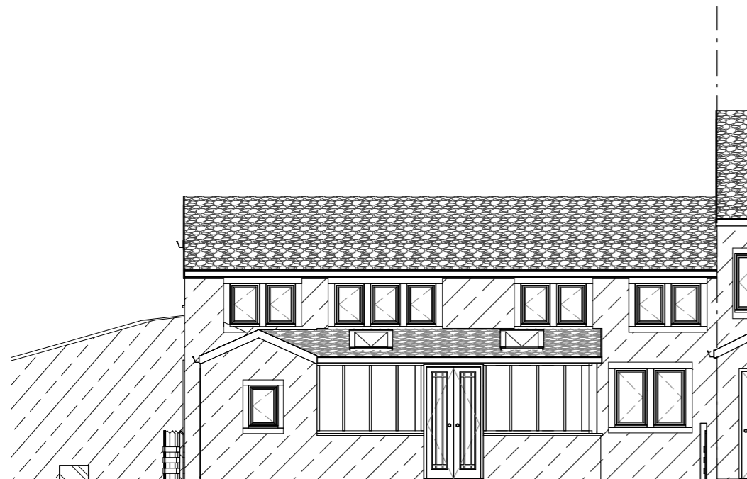
3 East 1 : 100