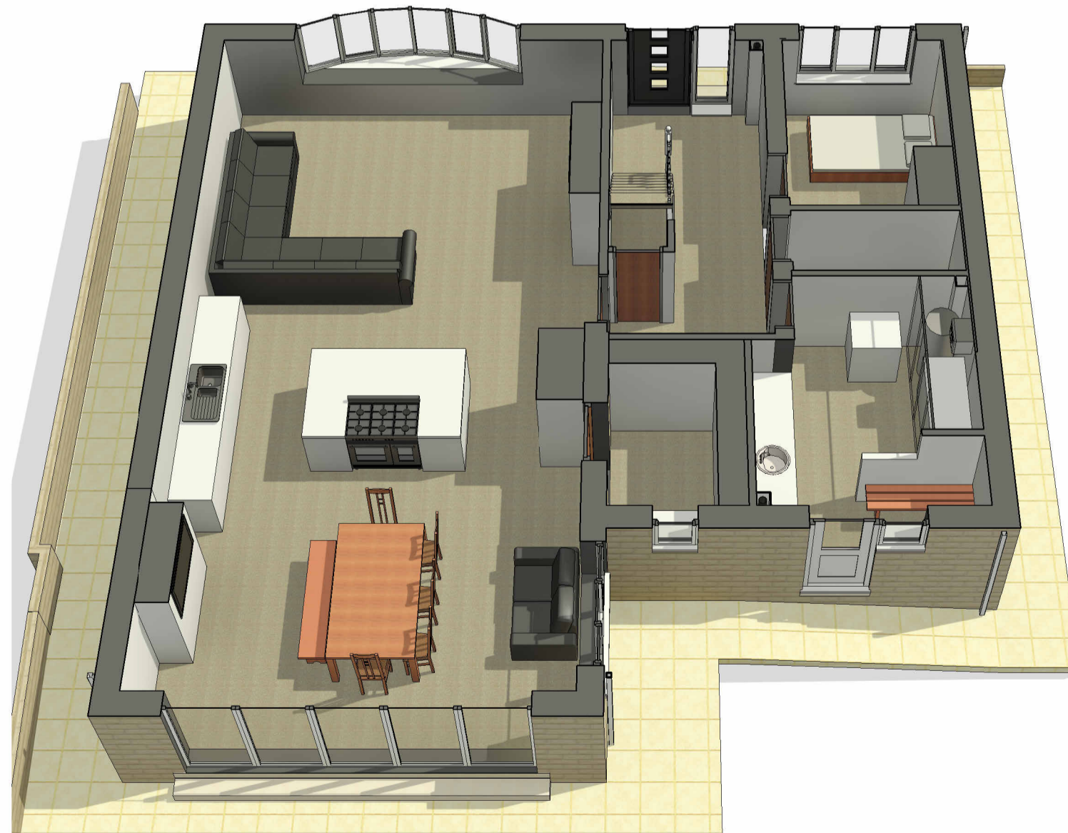
ground floor 3D rear

This drawing has been prepared specifically for the purpose of obtaining Planning Permission and/or Building Regulation Approval. Its suitability for other purposes, without supplementary details and specifications cannot be guaranteed. The Permissions and/or Approvals are beyond the Architects control, and no guarantee that such will be granted is given or to be inferred by reason of the preparation of this drawing. Only figured dimensions are to be used. All dimensions to be checked on site. This drawing together with the design is the property and copyright of the Architect and must not be reproduced without prior written permission.