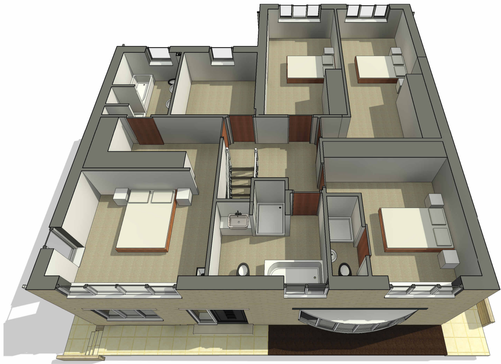
first floor 3D front