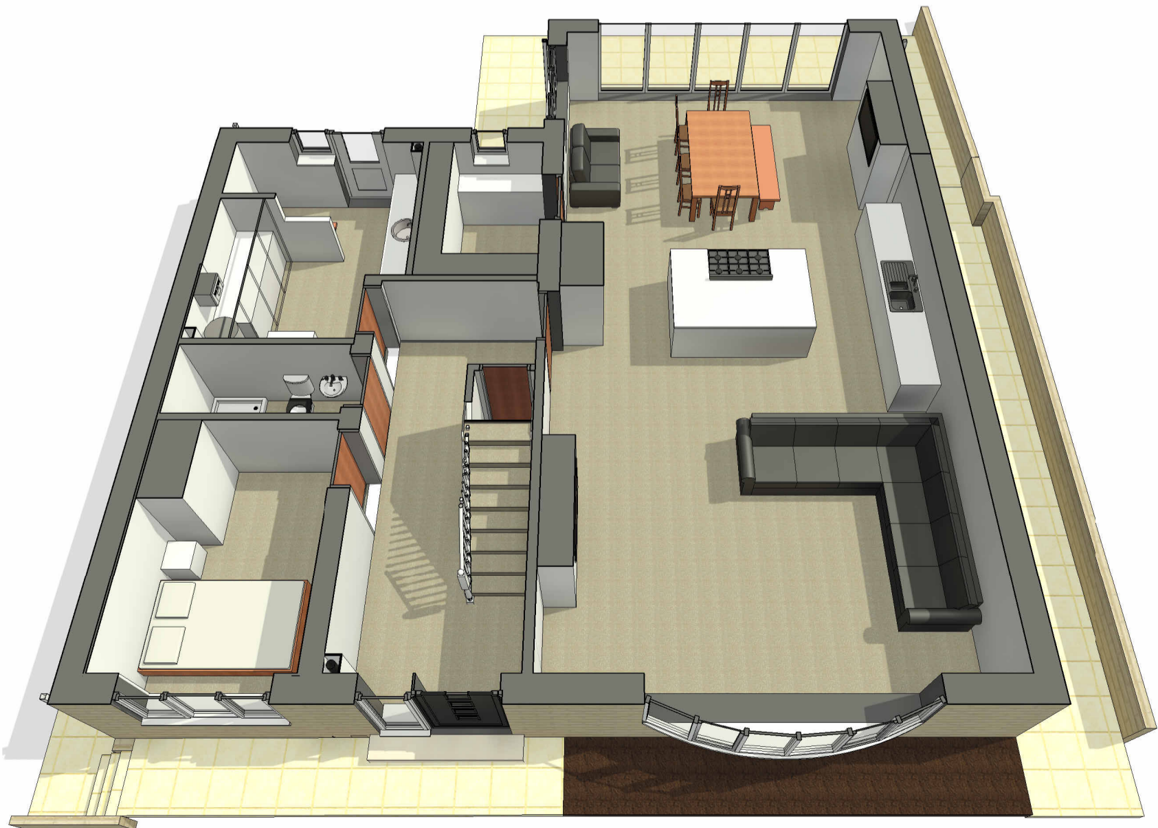
ground floor 3D front