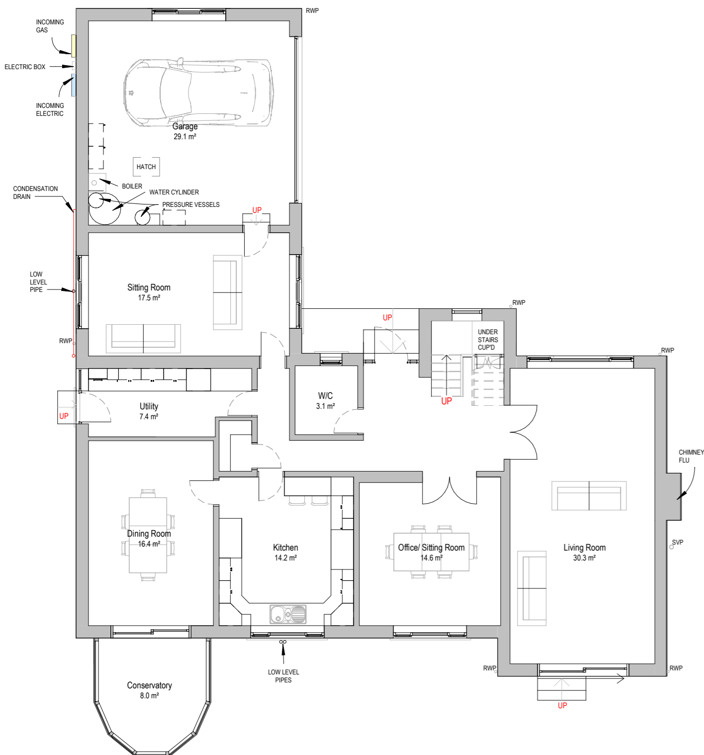
GROUND FLOOR PLAN 1 : 100