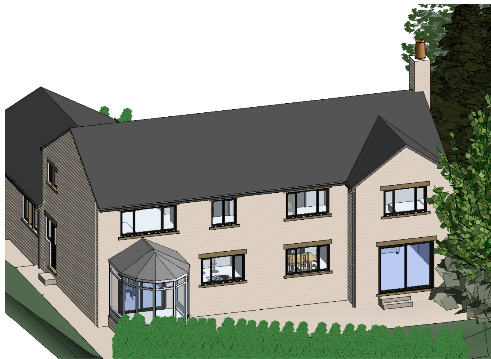
3D VIEW 2