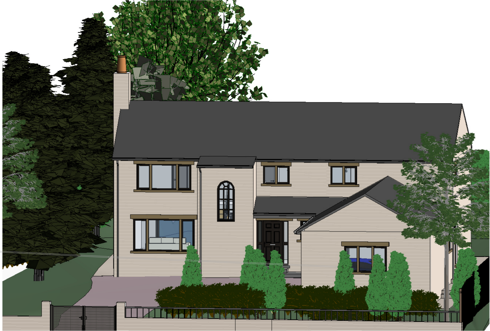
3D VIEW 1