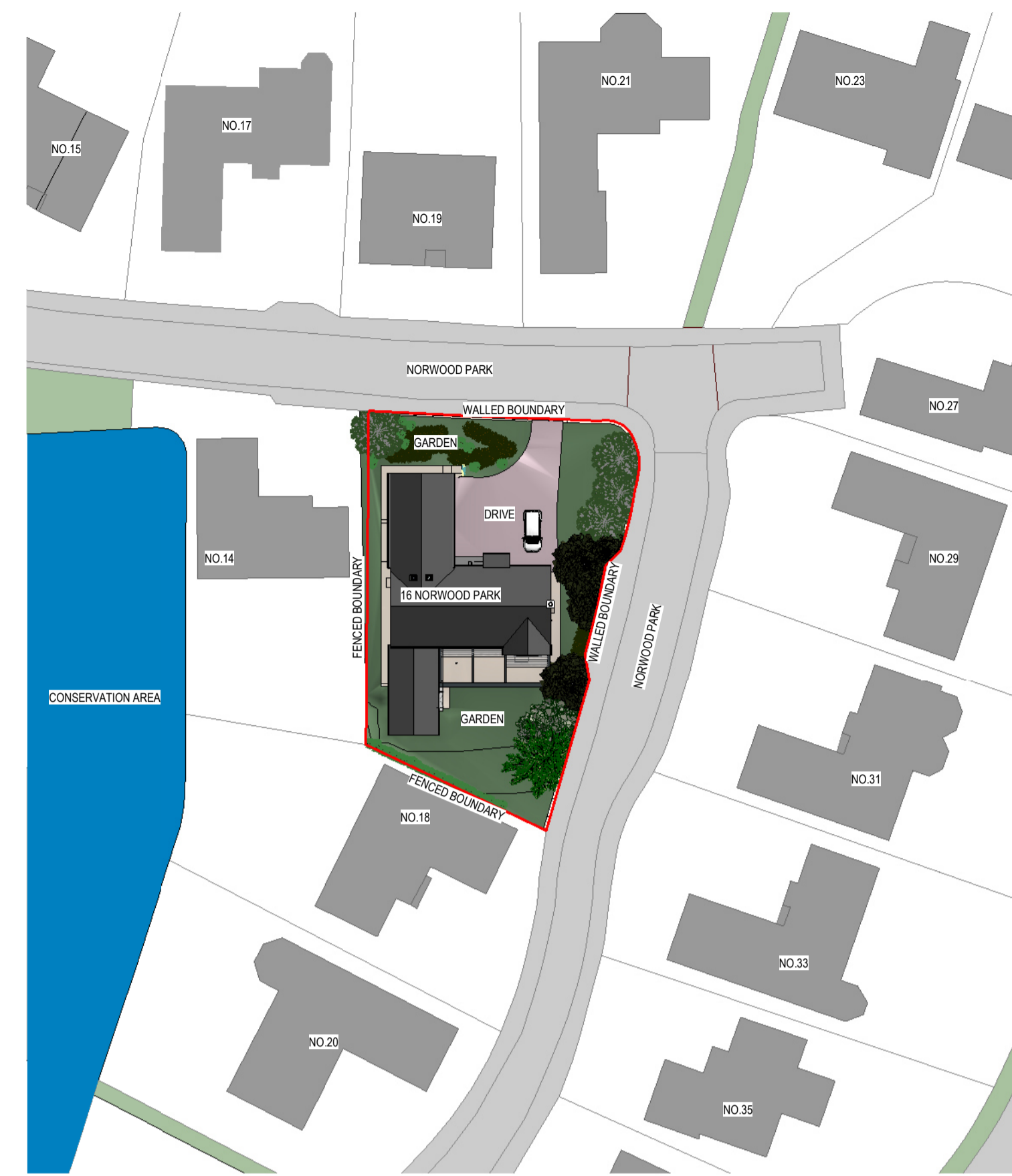
PROPOSED OVERALL SITE PLAN 1 : 500