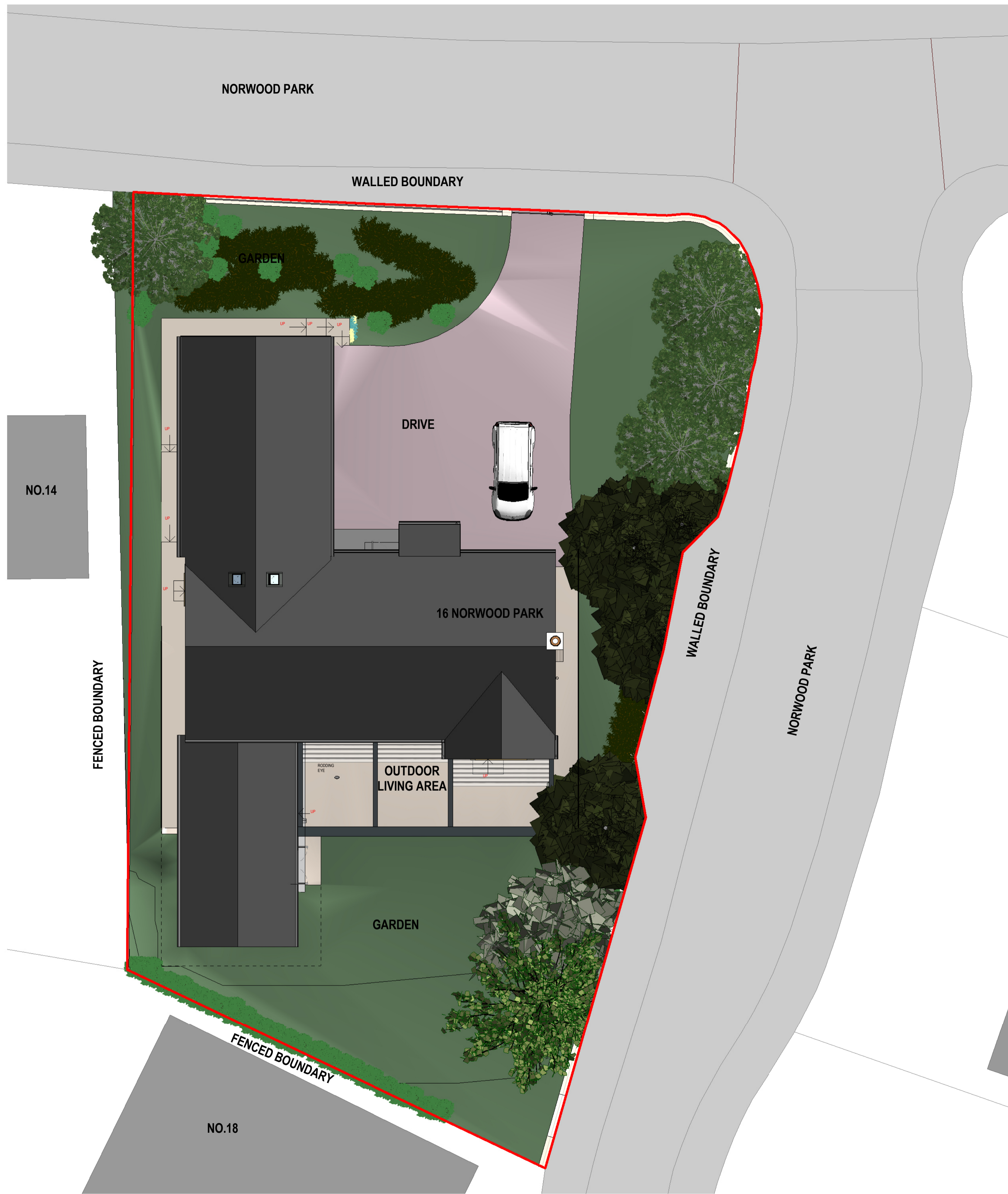
PROPOSED SITE PLAN 1 : 100