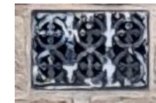
Existing Air Bricks