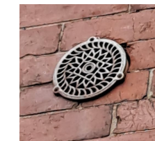
Proposed Roof Fan Outlet