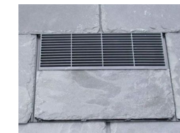
Natural slate with plastic grill