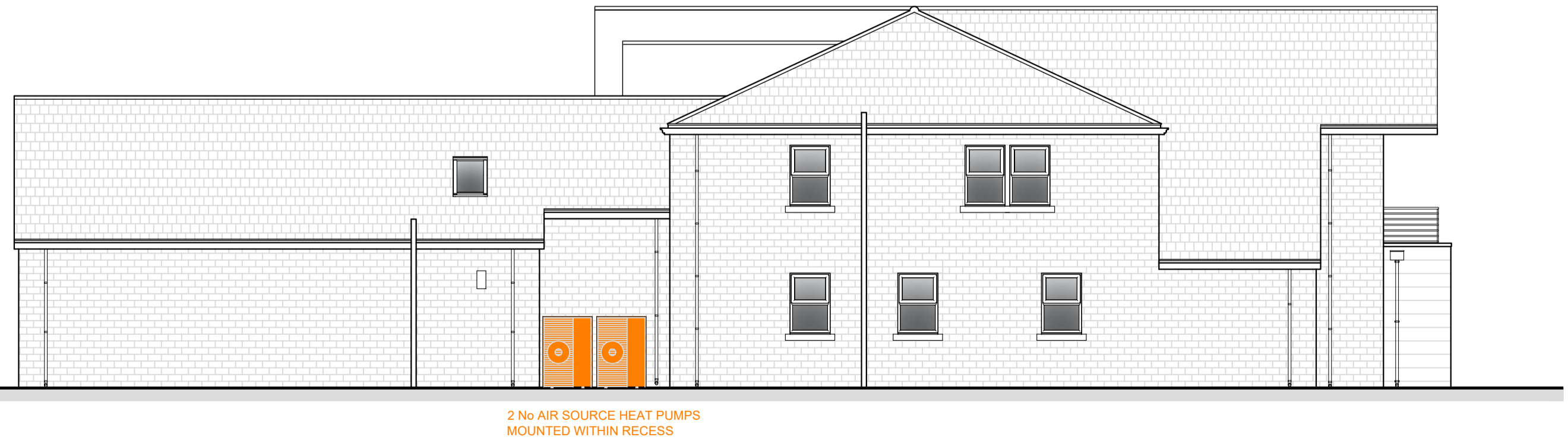
2 NORTH-WEST ELEVATION SHOWING LOCATION OF HEAT PUMPS SCALE 1:100